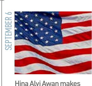
a deal with prosecutors to return to the United States.