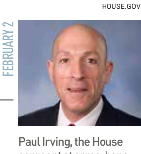
sergeant at arms, bans the IT workers from the House network.