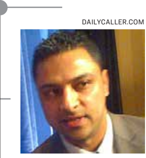
United States from Pakistan under the diversity lottery program.