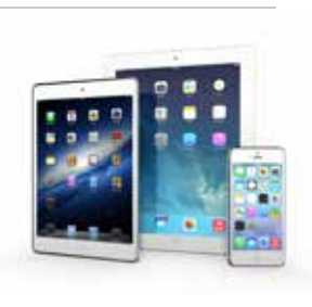
The Committee on House Administration notices the offices where the Awans work are falsifying invoices for tech equipment so that large purchases are treated as petty cash and not inventoried by central authorities. An employee of CDW Government, a major contractor, agreed to manipulate the invoices. Much of this equipment is missing, and the Awans' relatives later say it was