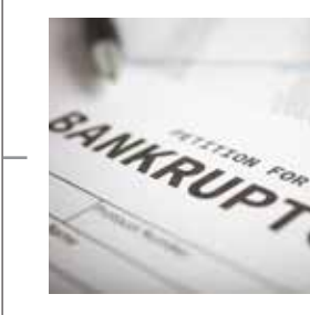
Abid Awan files for bankruptcy, discharging $1.1 million in debts.