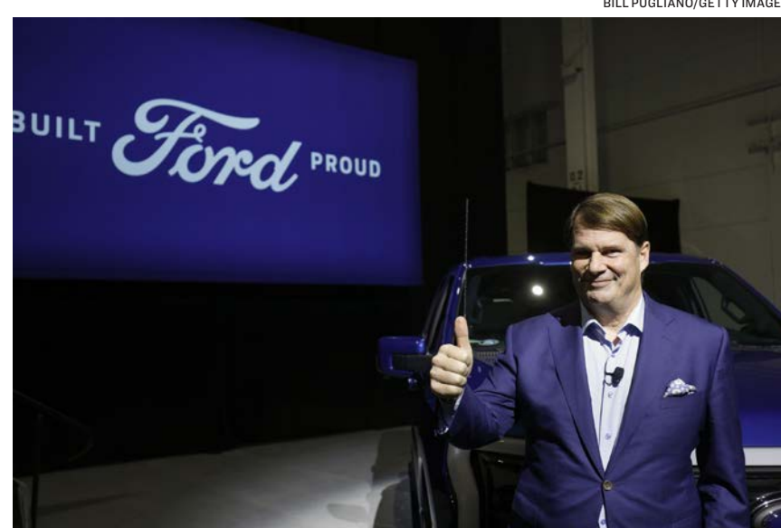
Ford CEO Jim Farley announces that the company will be partnering with CATL to create a multi-billion dollar electric-vehicle battery plant, in Romulus, Mich., on Feb. 13.