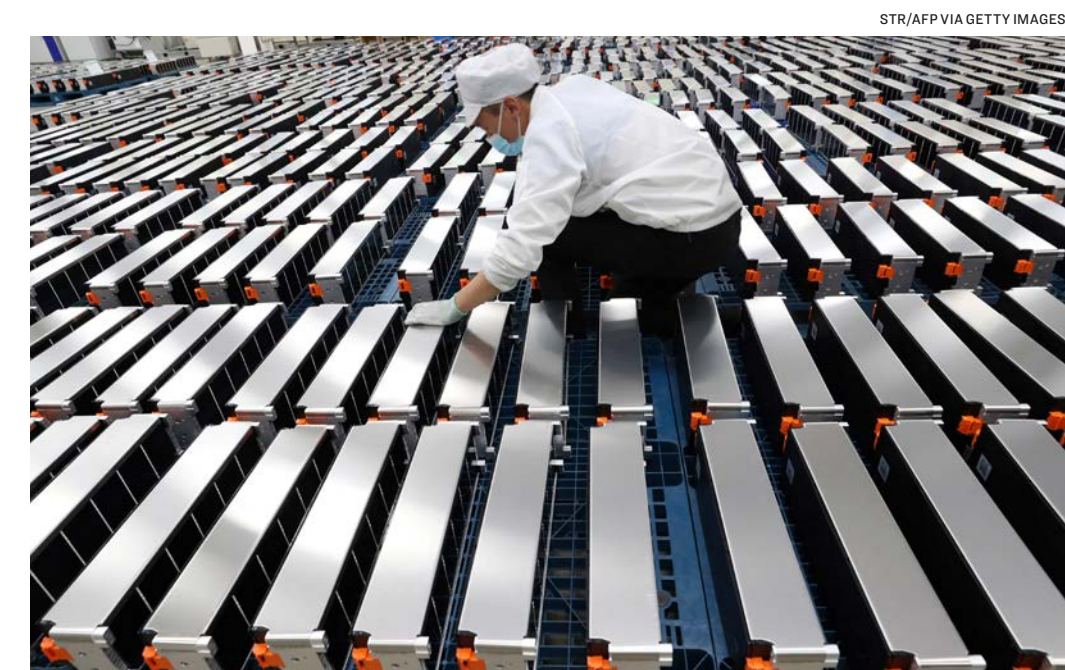
A worker check car batteries at a factory that makes lithium batteries for electric cars and other uses, in Nanjing, Jiangsu Province, China, on March 12, 2021. No foreign providers had access to the Chinese EV battery market before June 2019.

These [tax] credits were intended to go to United States operations, not Chinese operations.