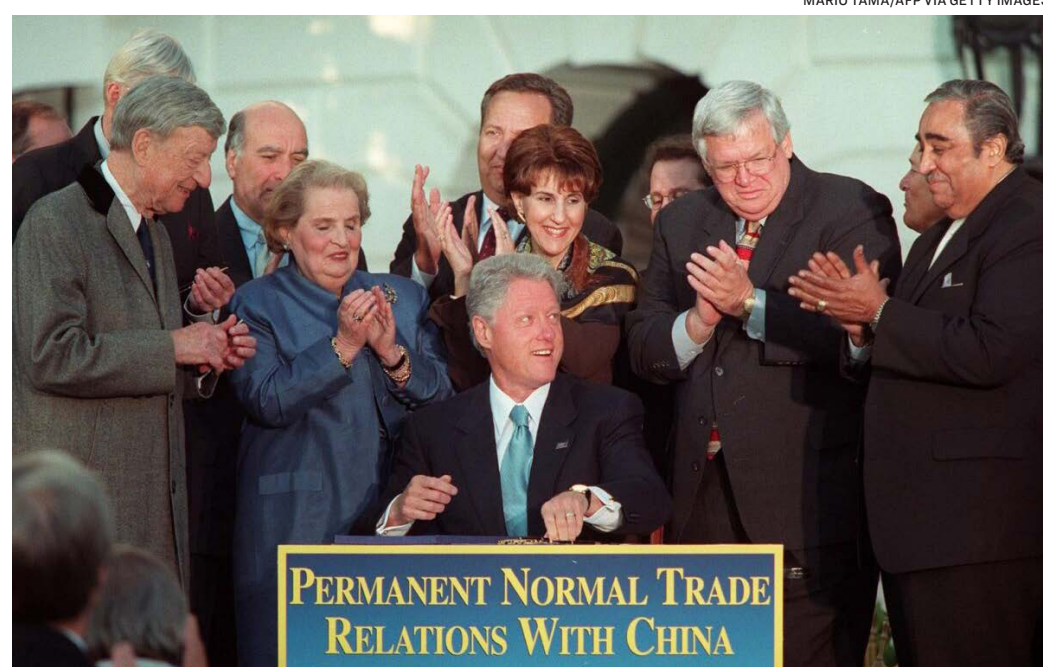
U.S. President Bill Clinton signs the U.S.-China Trade Relations Act of 2000 during a ceremony on the South Lawn of the White House in Washington on Oct. 10, 2000. With him are (left to right): Sen. William Roth (R-Del.), U.S. Secretary of State Madeleine Albright, U.S. Trade Ambassador Charlene Barshefsky, Speaker of the House Dennis Hastert, and Rep. Charles Rangel (D-N.Y.).