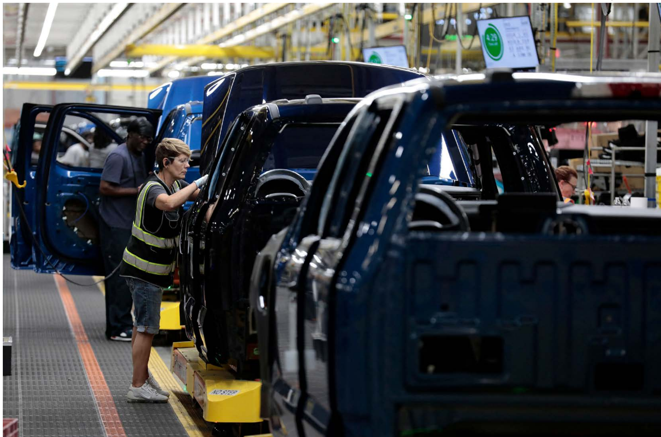
Ford's electric F-150 Lightning in the production line at the company's Rouge Electric Vehicle Center in Dearborn, Mich., on Sept. 8, 2022.