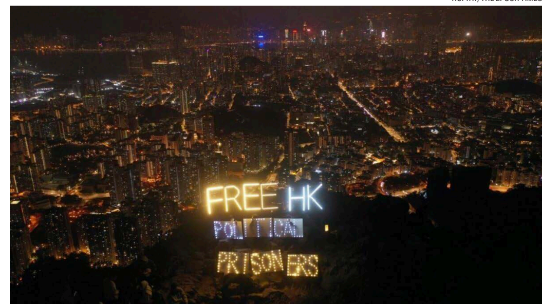
More than a dozen Hong Kong people are holding LED luminaires and electronic candles to display the words "Free HK political prisoners" atop Lion Rock in Hong Kong on Dec. 31, 2022.

angry with Chinese policies and the Chinese Communist Party's (CCP) political system."