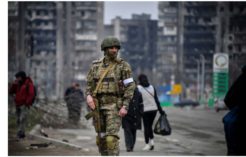
A Russian soldier patrols a street in Mariupol, Ukraine, on April 12, 2022.