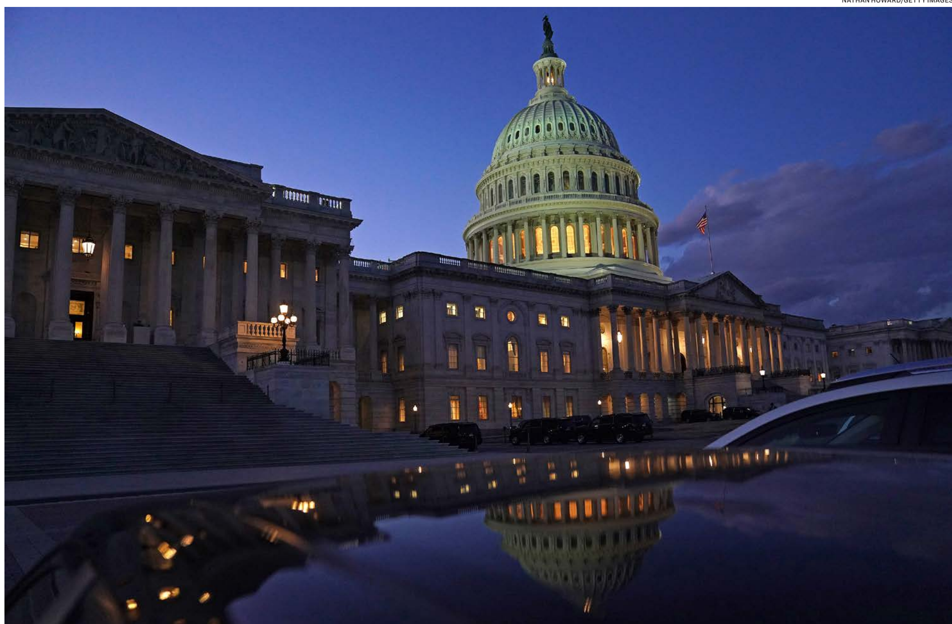
The sun sets over the U.S. Capitol building in Washington, D.C., on Jan. 5, 2023.