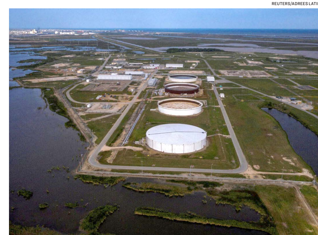
An aerial view of the Bryan Mound Strategic Petroleum Reserve, an oil storage facility, in Freeport, Texas, on April 27, 2020.

principal at Corr Analytics Inc., publisher of the Journal of Political Risk, and has conducted extensive research in North America, Europe, and Asia. His latest books are "The Concentration of Power: Institutionalization, Hierarchy, and Hegemony" (2021) and "Great Powers, Grand Strategies: The New Game in the South China Sea" (2018).