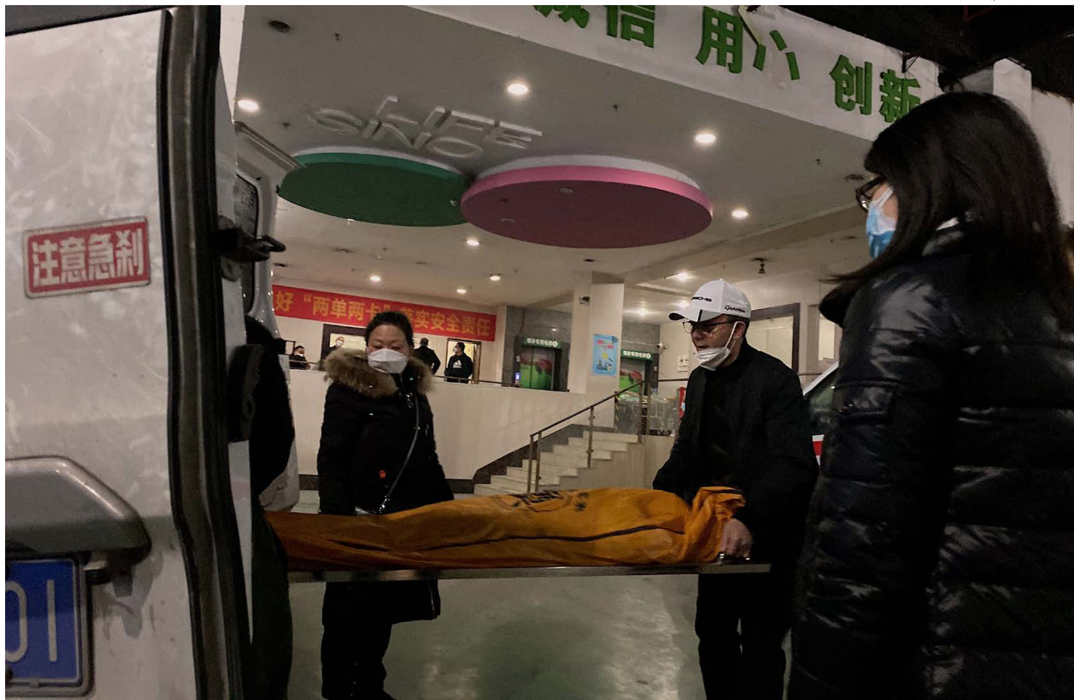
Funeral workers load a body onto a cart at a crematorium in Chongqing, China, on Dec. 22, 2022.