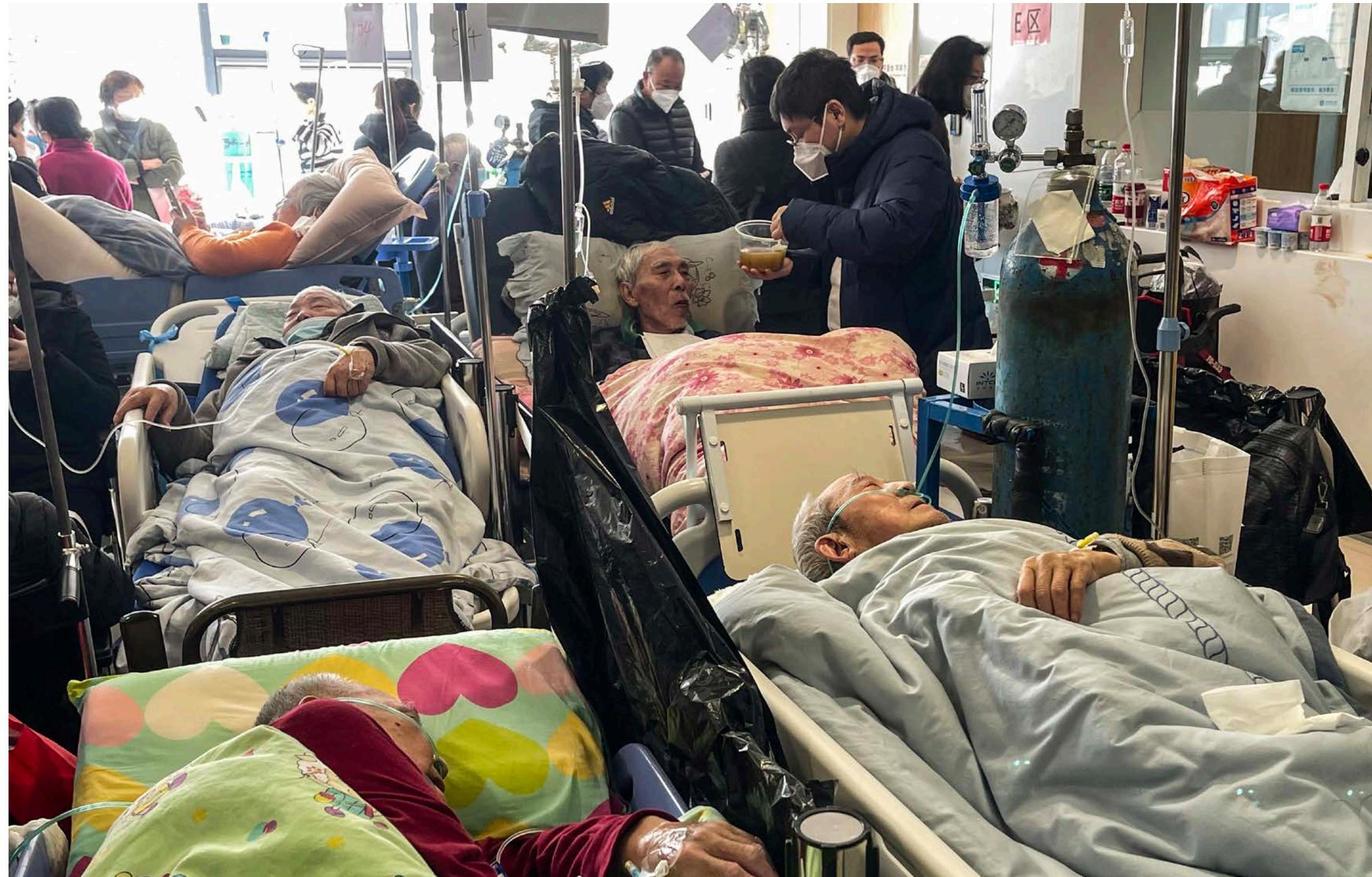
Patients on stretchers at a hospital in Shanghai on Jan. 3, 2023.