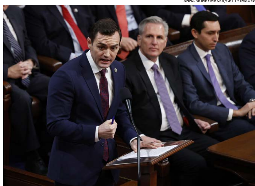
U.S. Rep. Mike Gallagher (R-Wis.) delivers remarks in the House Chamber at the U.S. Capitol Building in Washington on Jan. 4, 2023.

Gallagher said he wants to connect those broader geopolitical concerns to the "day-to-day reality for Americans and explain why this is ... the biggest