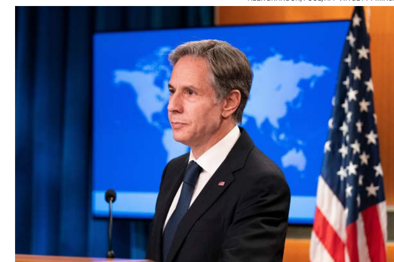
Secretary of State Antony Blinken speaks about Afghanistan during a media briefing at the State Department in Washington on Aug. 25, 2021.