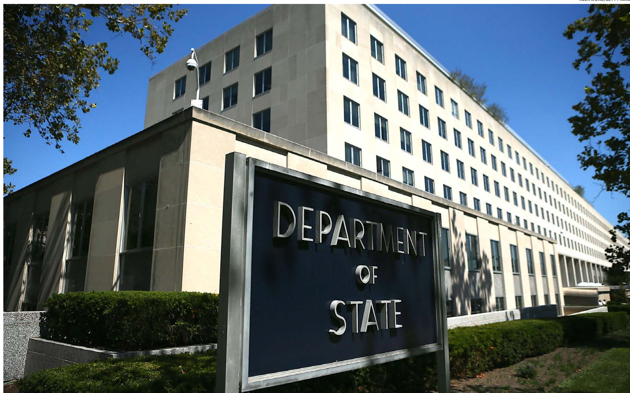
The U.S. State Department in Washington on Sept. 12, 2012.

Madeleine Albright had a direct hand in the Kosovo War (1998-99) by facilitating a de facto alliance with the Kosovo Liberation Army (previously designated