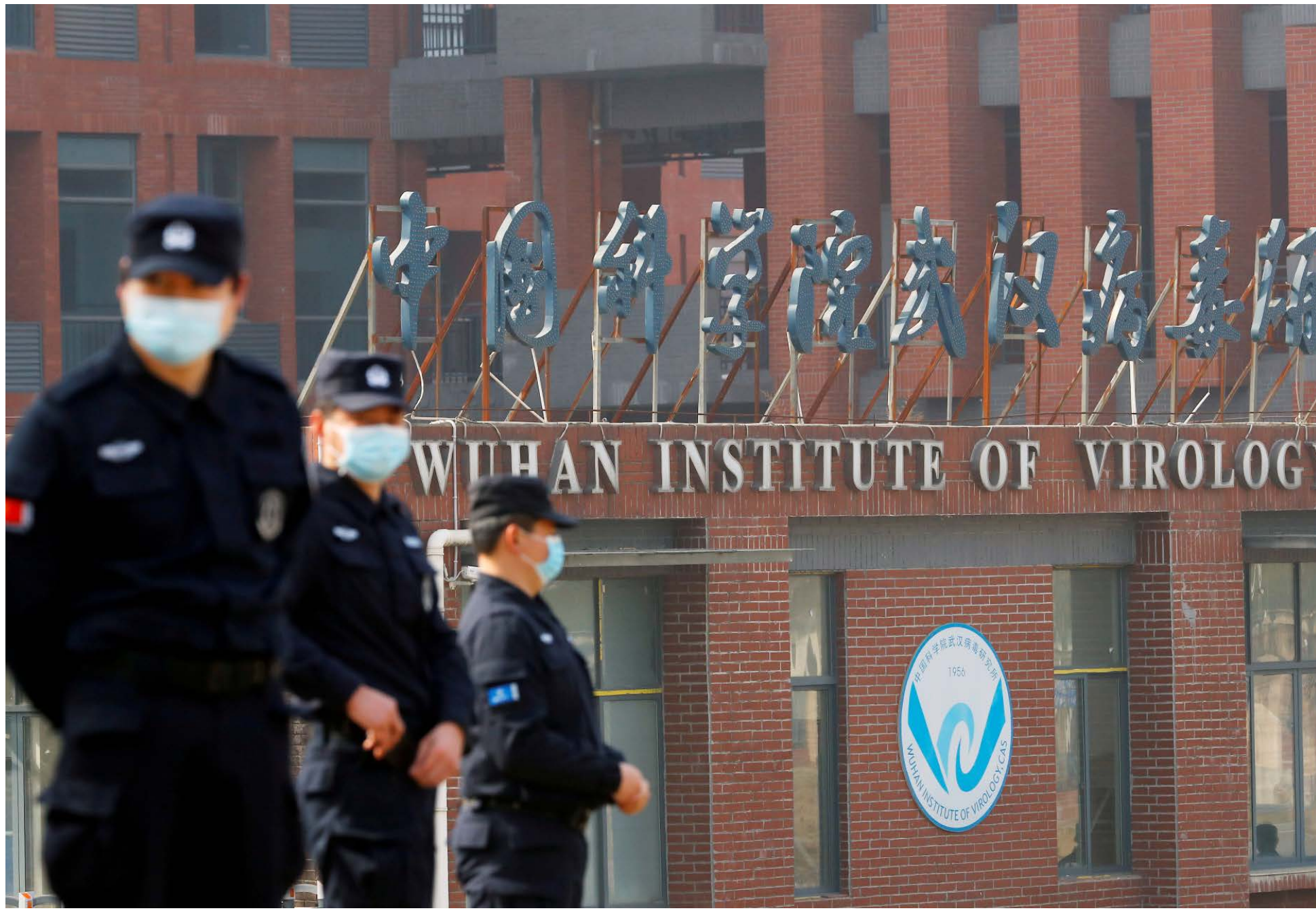
Security personnel keep watch outside the Wuhan Institute of Virology during the visit by the World Health Organization team tasked with investigating the origins of the CCP virus, in Wuhan, Hubei Province, China, on Feb. 3, 2021.