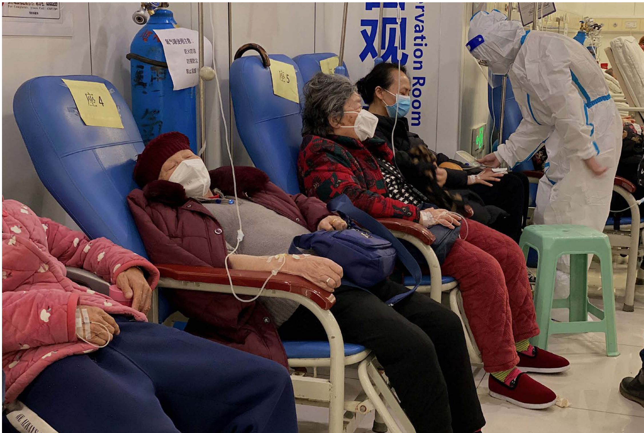
COVID-19 patients resting at the Second Affiliated Hospital of Chongqing Medical University in China's southwestern city of Chongqing on Dec. 23, 2022.

“We can't take more at this point,” a worker from a nearby crematorium told The Epoch Times. From burners to vans to storage rooms, all were running at maximum capacity, the worker said; the bodies have filled more than 200 morgue freezers.