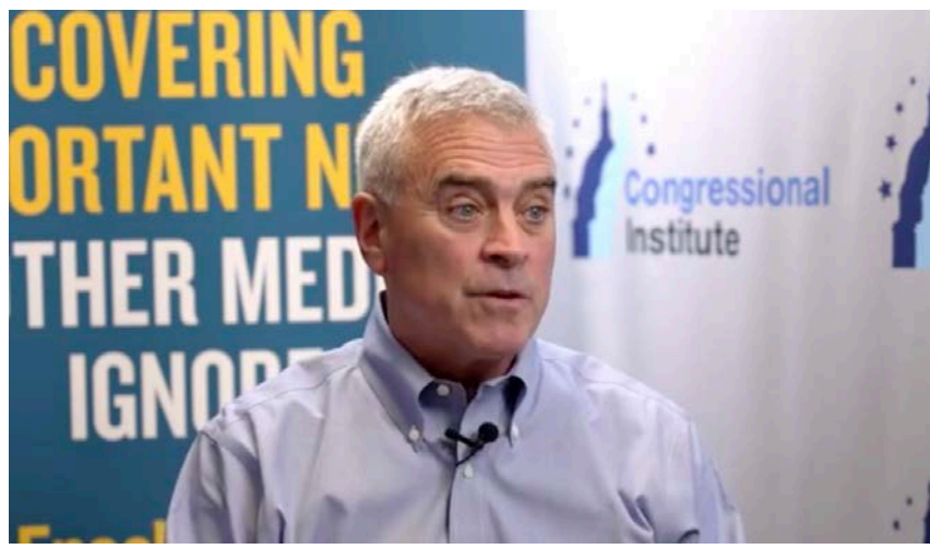
Doctor and Congressman Brad Wenstrup (R-Ohio) interviews with NTD Capitol Report on April 2, 2022.

"The book described how to create weaponized chimeric SARS coronaviruses, the potentially broader scope for their use compared to traditional bioweapons, and the benefits of being able to plausibly deny