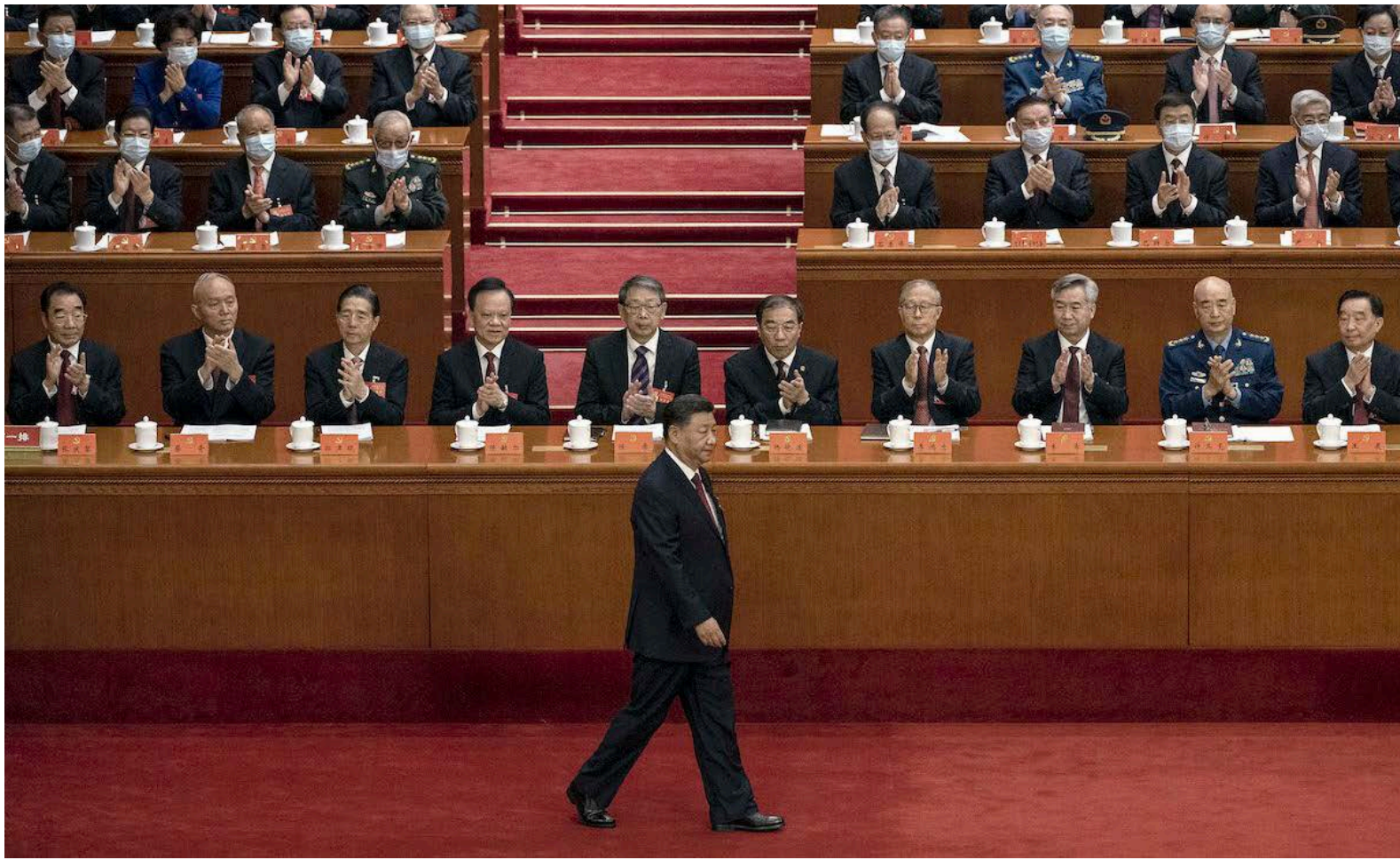
Chinese leader Xi Jinping (C) is applauded by senior members of the government and delegates as he walks to the podium to make a speech during the opening ceremony of the 20th National Congress in Beijing on Oct. 16, 2022.

If the CCP's rule relies heavily on high technology, which also costs money, the CCP cannot bring the economy down completely. In its annual budget, there is a big chunk called "stability maintenance expenses" to keep the repressive apparatus running, such as the salaries