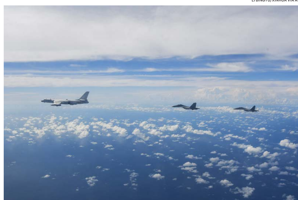
Aircraft of the eastern theater command of the Chinese People's Liberation Army conduct joint combat training exercises around Taiwan on Aug. 7, 2022.