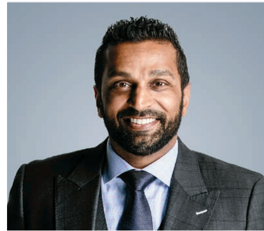
Kash Patel Host of "Kash's Corner"