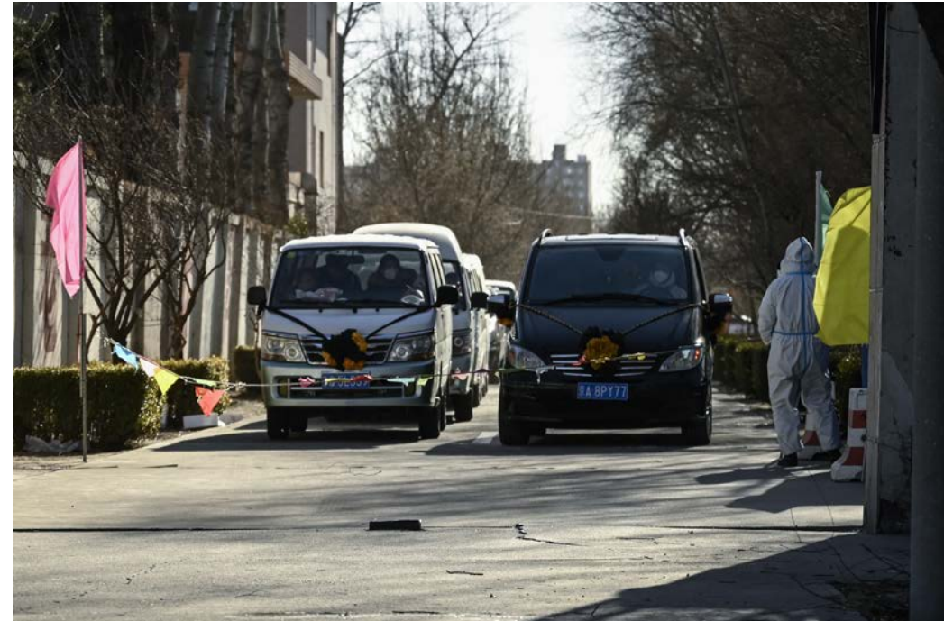
Hearses are seen waiting to enter a crematorium in Beijing on Dec. 22, 2022.

“We got 90 today,” an employee told The Epoch Times on Dec. 22 on the condition of anonymity, adding that four other morgues in the city are similarly inundated. The facility has run out of vehicles for transporting corpses, the worker said.