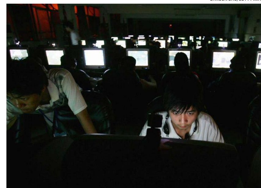
A young man in a cyber cafe sits at a computer.

"As a result, Beijing and Moscow have improved their defense and security ties in addition to other things like economics, infrastructure, energy, and natural resources. This especially includes cyber partnerships between China and Russia in terms of cooperation and coordination regarding information security and operations between the two."