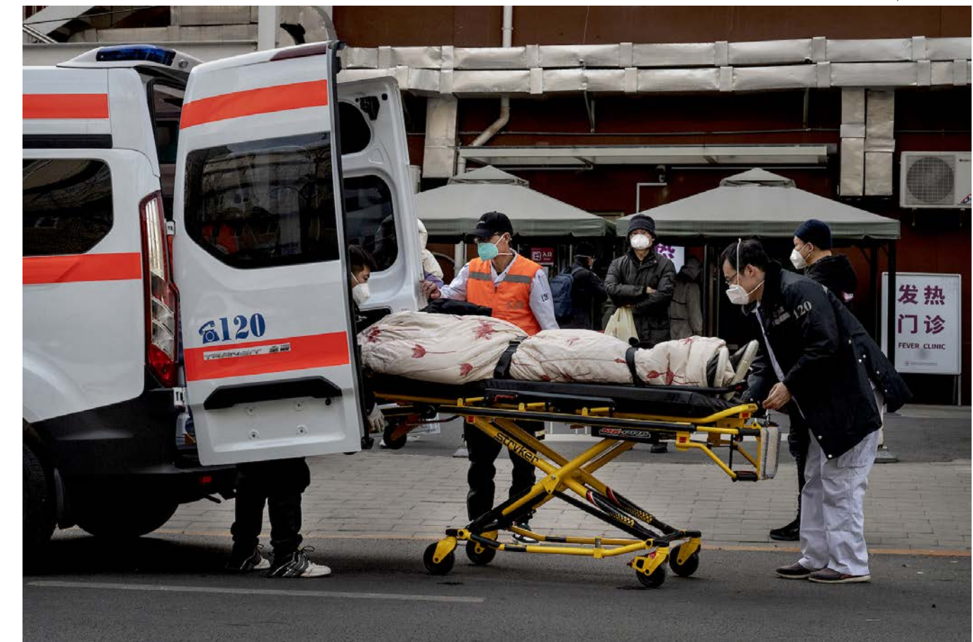
Ambulance drivers unload a patient outside a clinic treating COVID-19 patients in Beijing on Dec. 21, 2022.