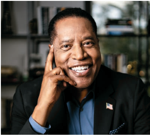
Larry Elder Host of "The Larry Elder Show"