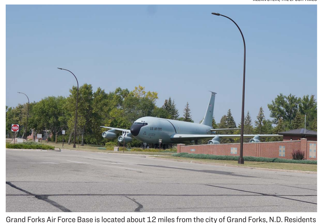
have organized to oppose a corn mill investment by a Chinese company with reputed ties to the Chinese Communist Party through its company chairman

which would "protect our national security by preventing foreign adversaries from taking any ownership or control of the United States agriculture industry."