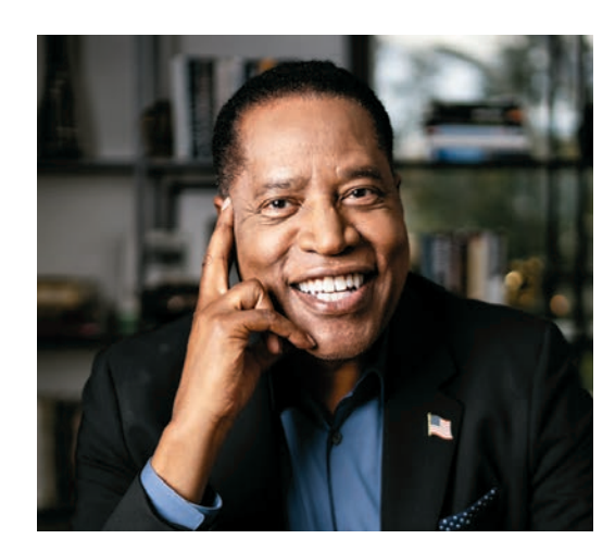
Larry Elder Host of "The Larry Elder Show"