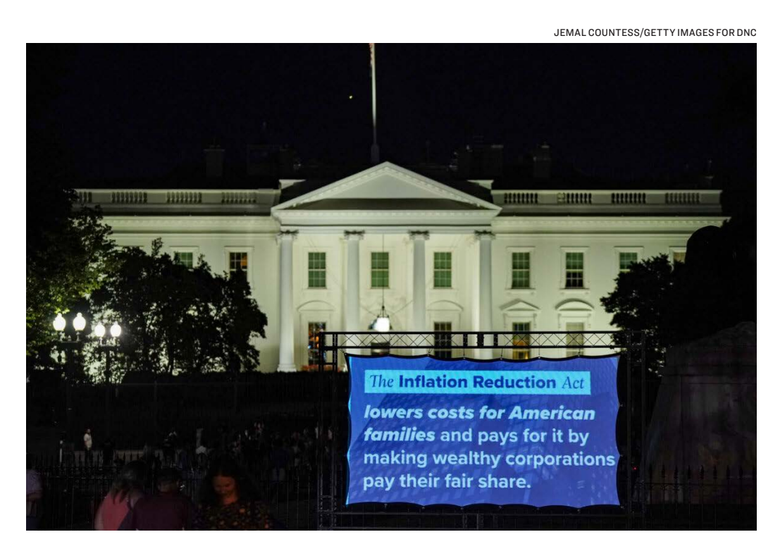
A projection display of the Democrats' passage of the Inflation Reduction Act is displayed in front of the White House on Aug. 12, 2022.