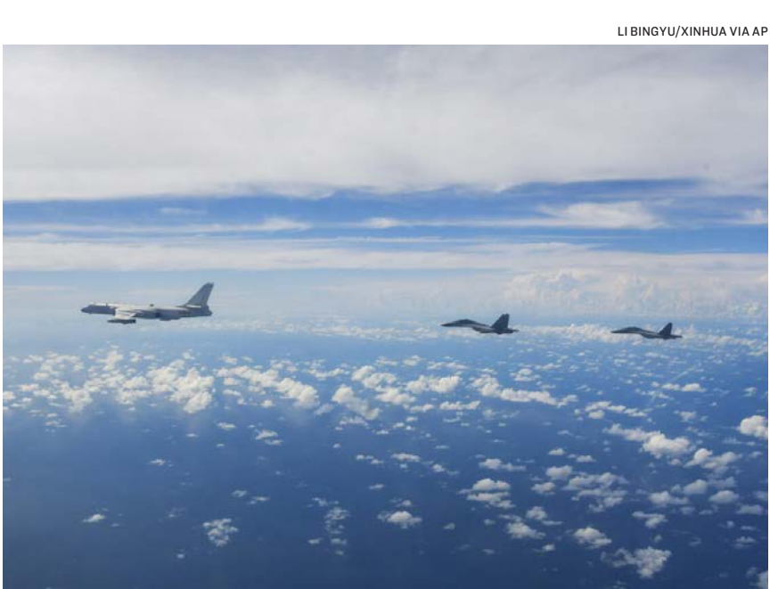
Aircraft of the Eastern Theater Command of the Chinese People's Liberation Army conduct joint combat training exercises around Taiwan on Aug. 7, 2022

Biden got outfoxed. again, because he thought he could achieve U.S. objectives in Asia with a big smile and velvet glove, sans the iron fist within.