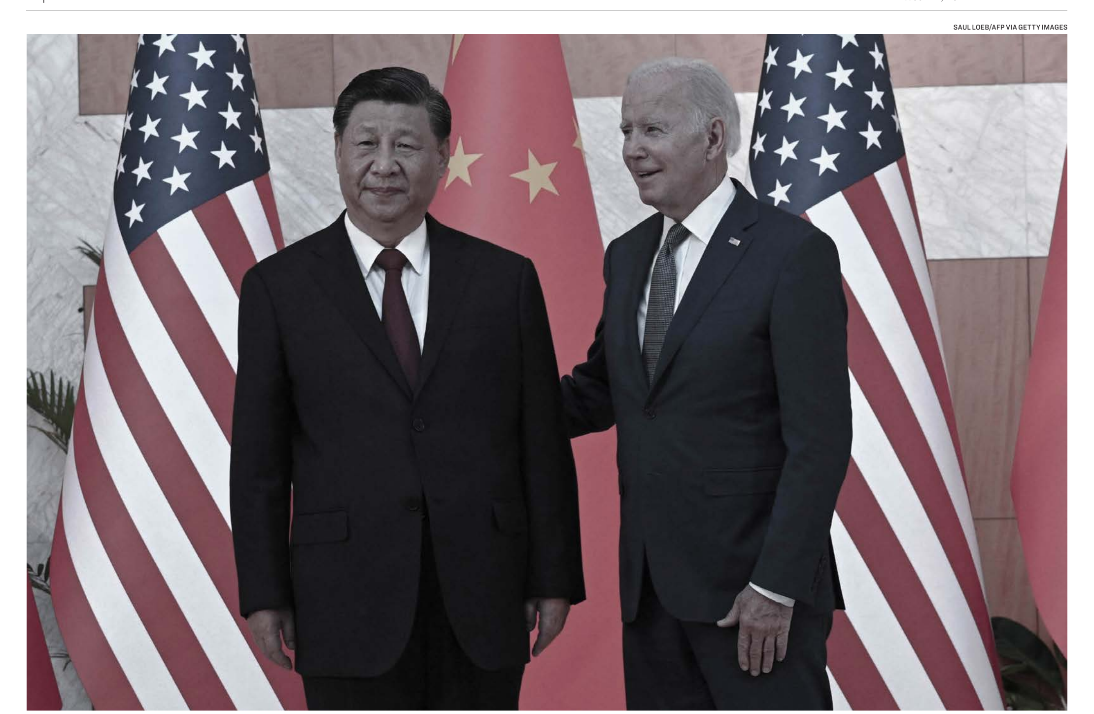
President Joe Biden and China's leader Xi Jinping meet on the sidelines of the G-20 Summit in Nusa Dua on the Indonesian resort island of Bali on Nov. 14, 2022.