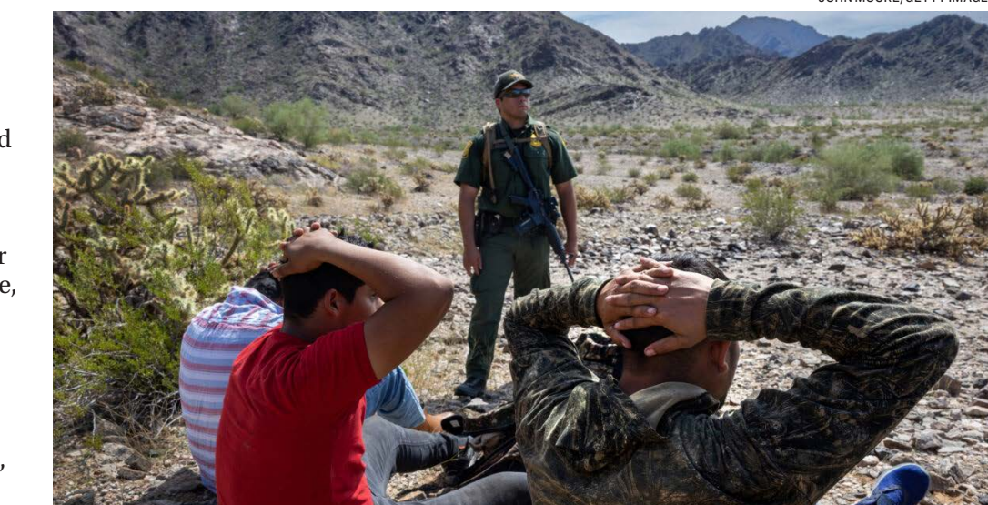
A U.S. Border Patrol agent watches over a group of illegal immigrants after tracking them through rugged terrain at the Organ Pipe Cactus National Monument, Ariz., on Sept. 28, 2022.

"FTX had partnered with Ukraine to process donations to their war efforts within days of Joe Biden pledging billions of American taxpayer dollars to the country," The Post Millennial reported. "Ukraine partnered with FTX as the Biden administration funneled funds to the invaded nation, and FTX then made massive donations to Demo-