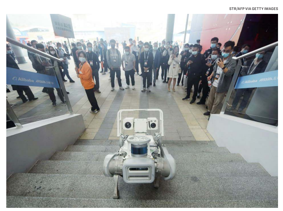
People watch a robotic dog at the Apsara Conference, a cloud computing and artificial intelligence conference in Hangzhou in Zhejiang Province, China, on Nov. 3, 2022.

range of over 300 miles and capable of low hypersonic speeds, they would pose a greater threat than the CASIC 250-mile range and supersonic speed anti-ship YJ-12 cruise missile currently in use.