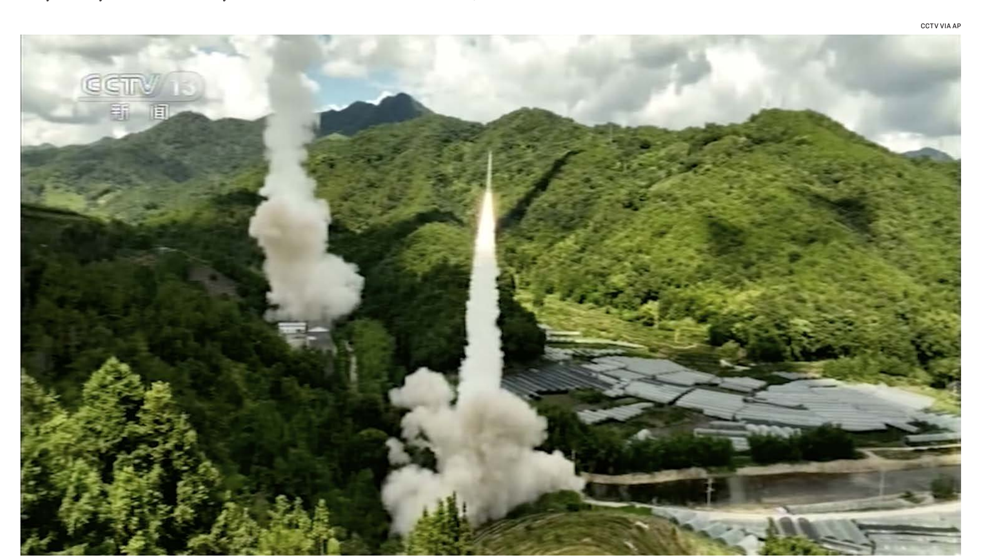
A missile is launched from an unspecified location in China on Aug. 4, 2022. The Chinese military fired missiles into waters near Taiwan as part of its planned exercises on Aug. 4.