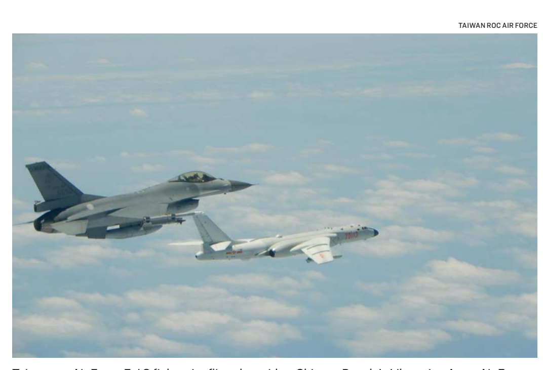
Taiwanese Air Force F-16 fighter jet flies alongside a Chinese People's Liberation Army Air Force (PLAAF) H-6K bomber in the western Pacific, one of the Chinese military aircraft that reportedly flew over Bashi Channel and Miyako Strait near Japan's Okinawa island chain on the morning of

An H-6K may be able to carry up to four missiles. With an estimated air-launched