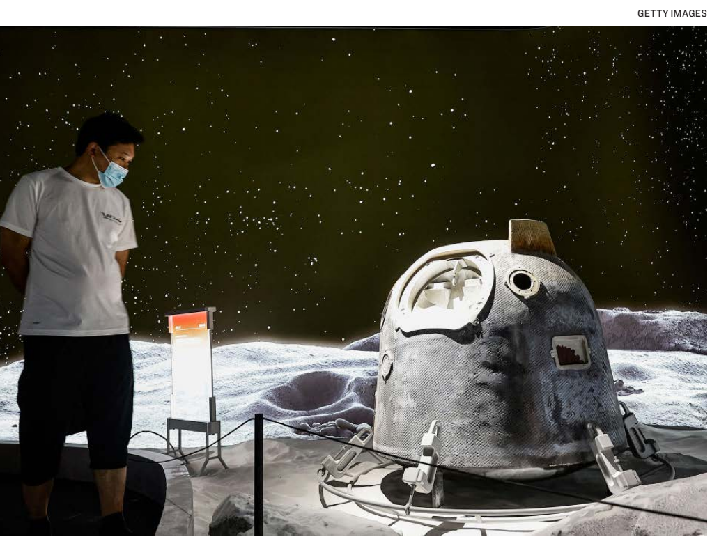
A visitor looks at the model of the lunar landing return capsule during Explore CASCI (China Aerospace Science and Cultural Innovation) ART Exhibition in Wuhan, China, on Oct. 2. 2022.