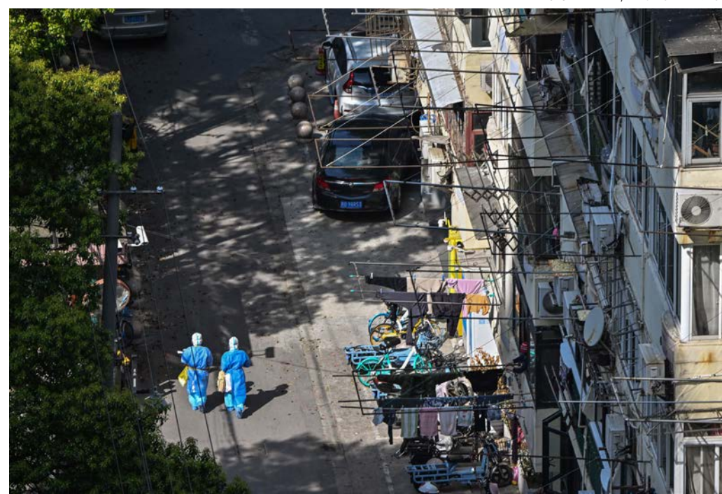
Health workers wearing personal protective equipment walk on a street in a neighborhood during a COVID-19 lockdown in the Jing'an district in Shanghai on April 8, 2022.

The release of the 38-page GAO report follows a January request from House Republican Conference Chairwoman Elise Stefanik (R-N.Y.) and Rep. Michael McCaul (R-Texas), the top Republican on the House Foreign Affairs Committee. They asked the GAO to review federal funds provided to China or to entities controlled by the Chinese Communist Party (CCP) for collaborative research, and U.S. contributions to multilateral institutions.