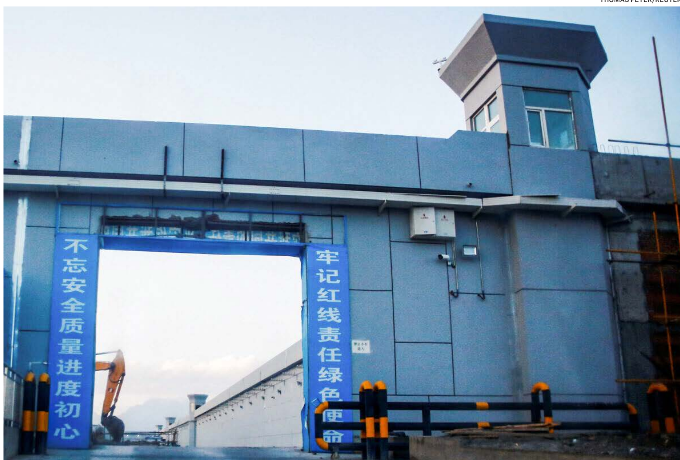
A gate of what is officially known as a vocational skills education center is photographed in Dabancheng, Xinjiang Uyghur region, China, on Sept. 4, 2018.

The CCP’s claims of “blood ties” to the Chinese people go further, coming off as defining the “Chinese people” in terms of a racial hierarchy, in which the Han ethnic