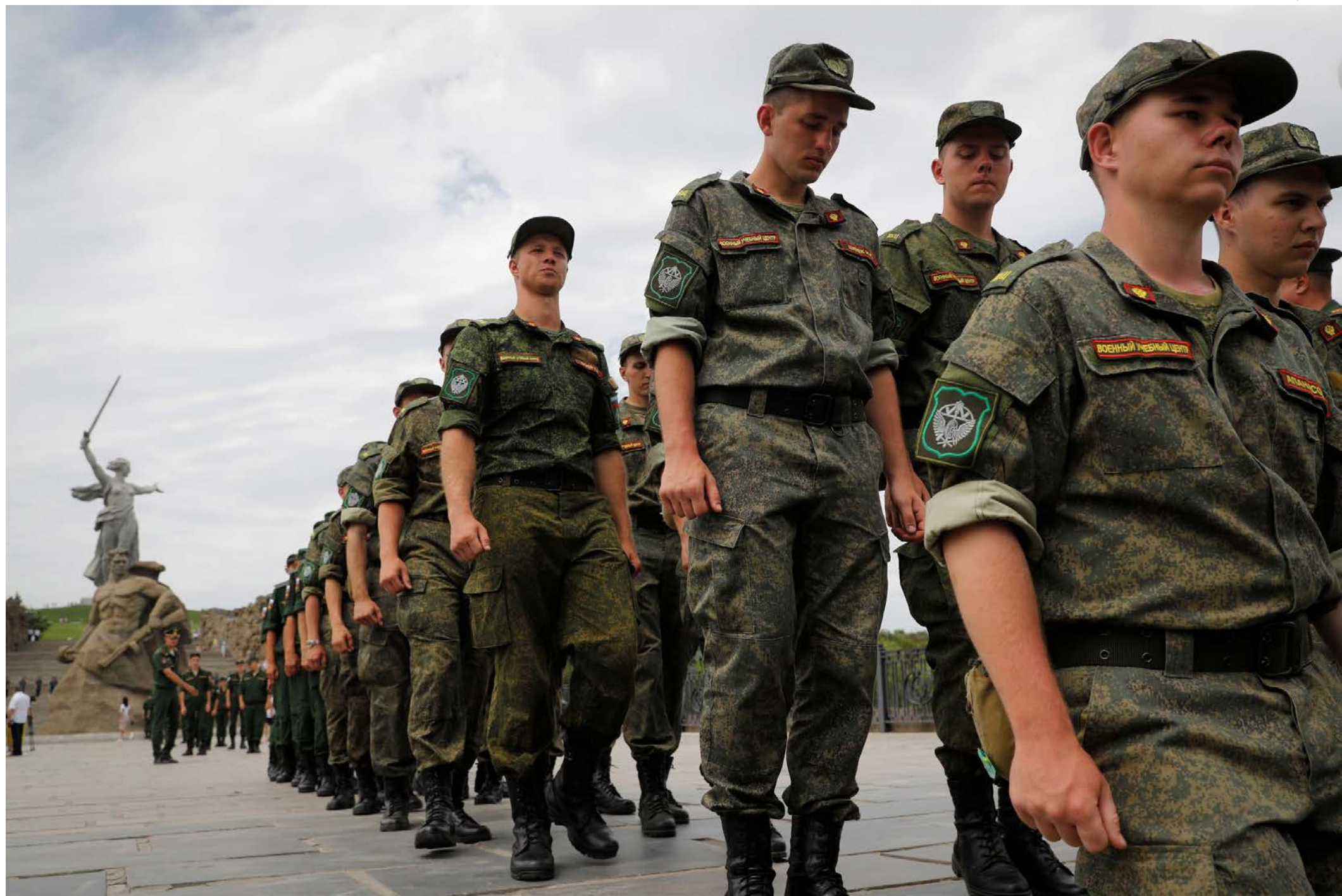
Russian army soldiers march during an action in support for the soldiers involved in the military operation in Ukraine, at the Mamaev Kurgan, a World War II memorial in Volgograd, Russia, on July 11, 2022.