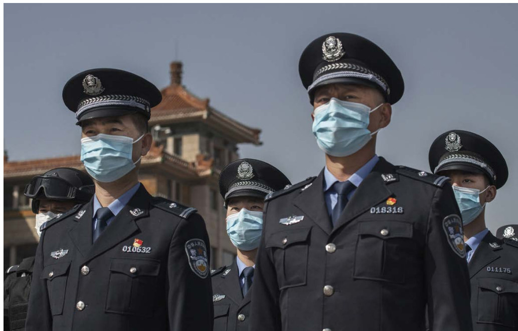
Chinese police officers wear protective masks at Beijing Railway Station in Beijing on April 4, 2020.

Officials at the ACA, the FBI, the Department of Justice, the State Department, and the New York attorney general’s office didn’t respond by press time to a request by The Epoch Times for comment.