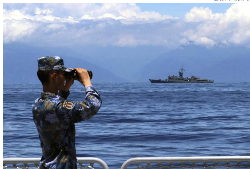
A People’s Liberation Army member looks through binoculars during military exercises as Taiwan’s frigate Lan Yang is seen in the background on Aug. 5, 2022.