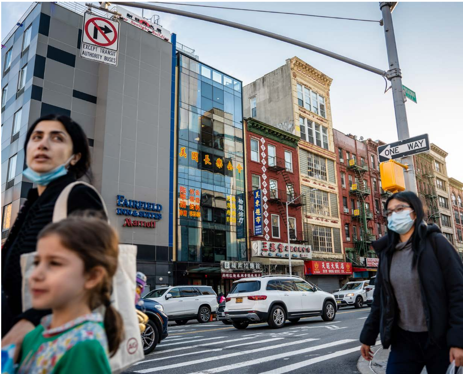
The America ChangLe Association in New York City on Oct. 6, 2022.