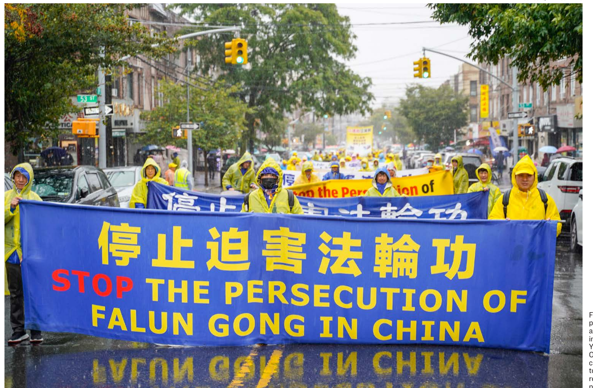
Falun Gong practitioners attend a parade in Brooklyn, New York City, on Oct. 2, 2021, to call for an end to the Chinese regime's persecution.