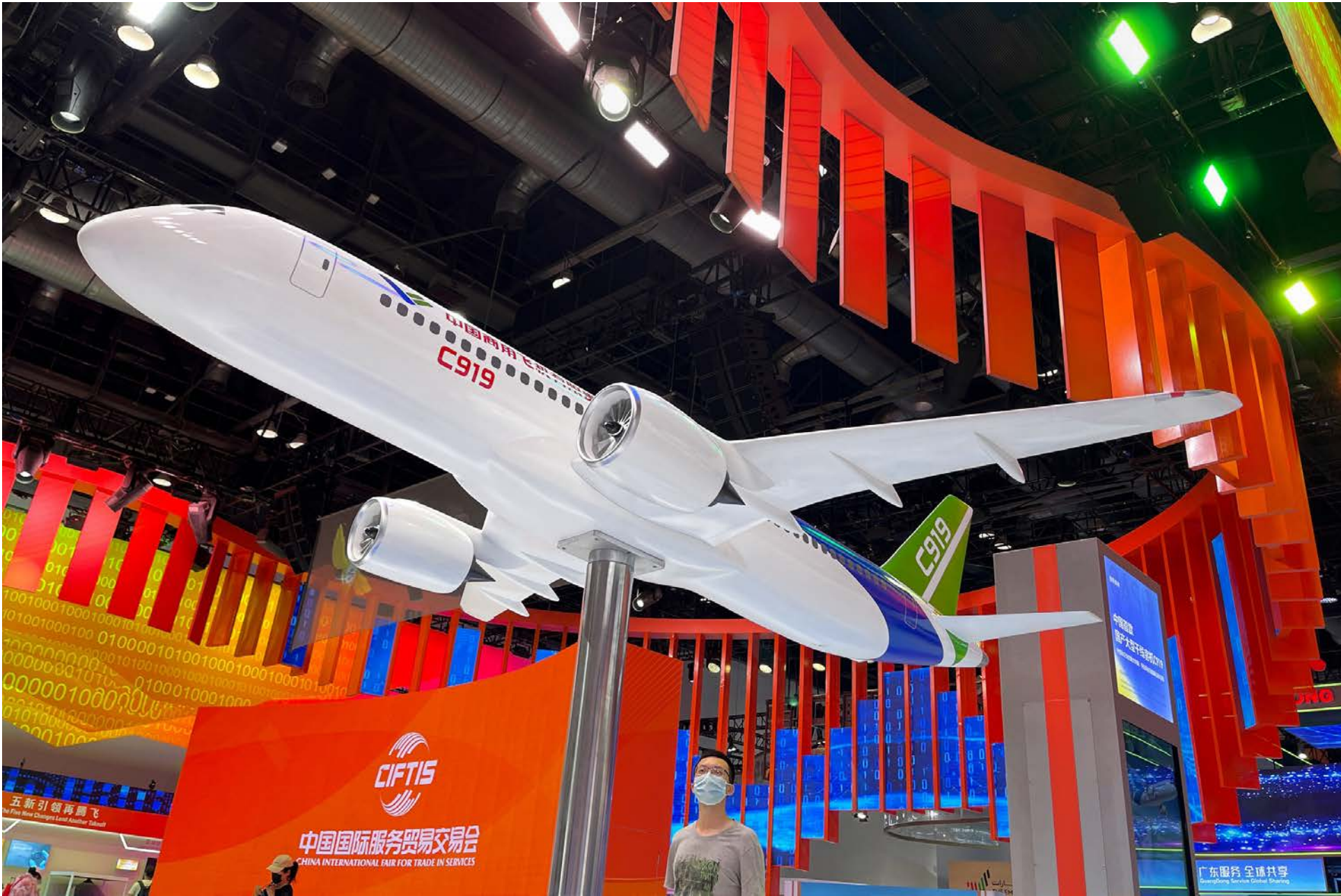
A model of C919 passenger aircraft is on display during the 2022 China International Fair for Trade in Services in Beijing, China, on Sept. 3, 2022.