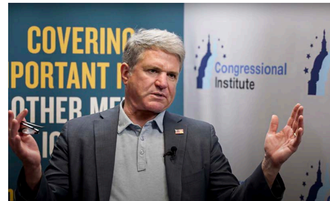
Rep. Michael McCaul (R-Texas) in an interview with The Epoch Times in Ponte Vedra, Fla., on March 24, 2022.

Republican on the House Foreign Affairs Committee and chairman of the House GOP's "China Task Force," told "Capitol Report" at the same event on Sept. 23.