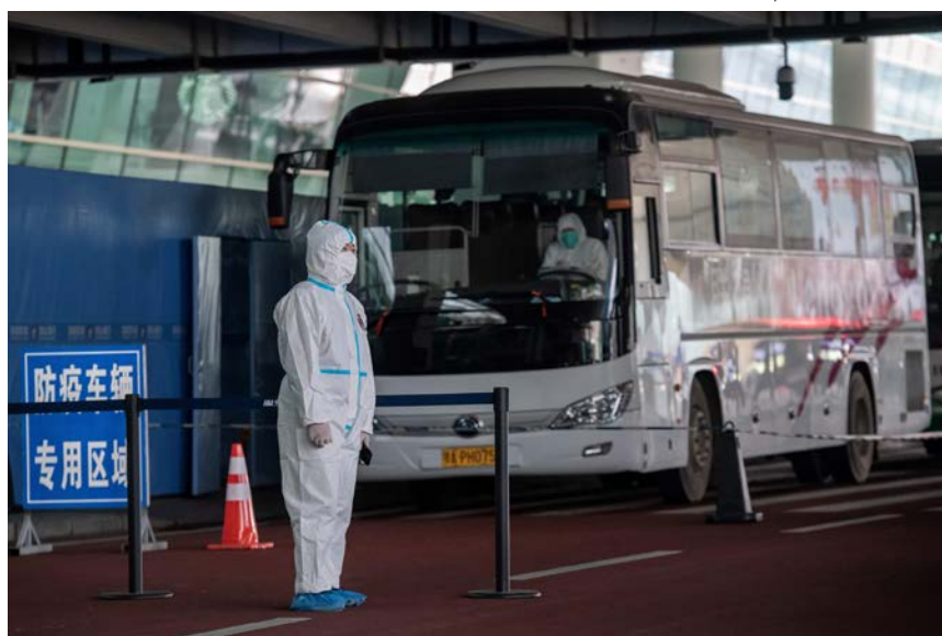
A health worker wearing a personal protection suit stands next to buses at a cordoned-off section at the international arrivals area, where arriving travelers are to be taken into quarantine, at the international airport in Wuhan, China, on Jan. 14, 2021.

He recalled that there was an outbreak of