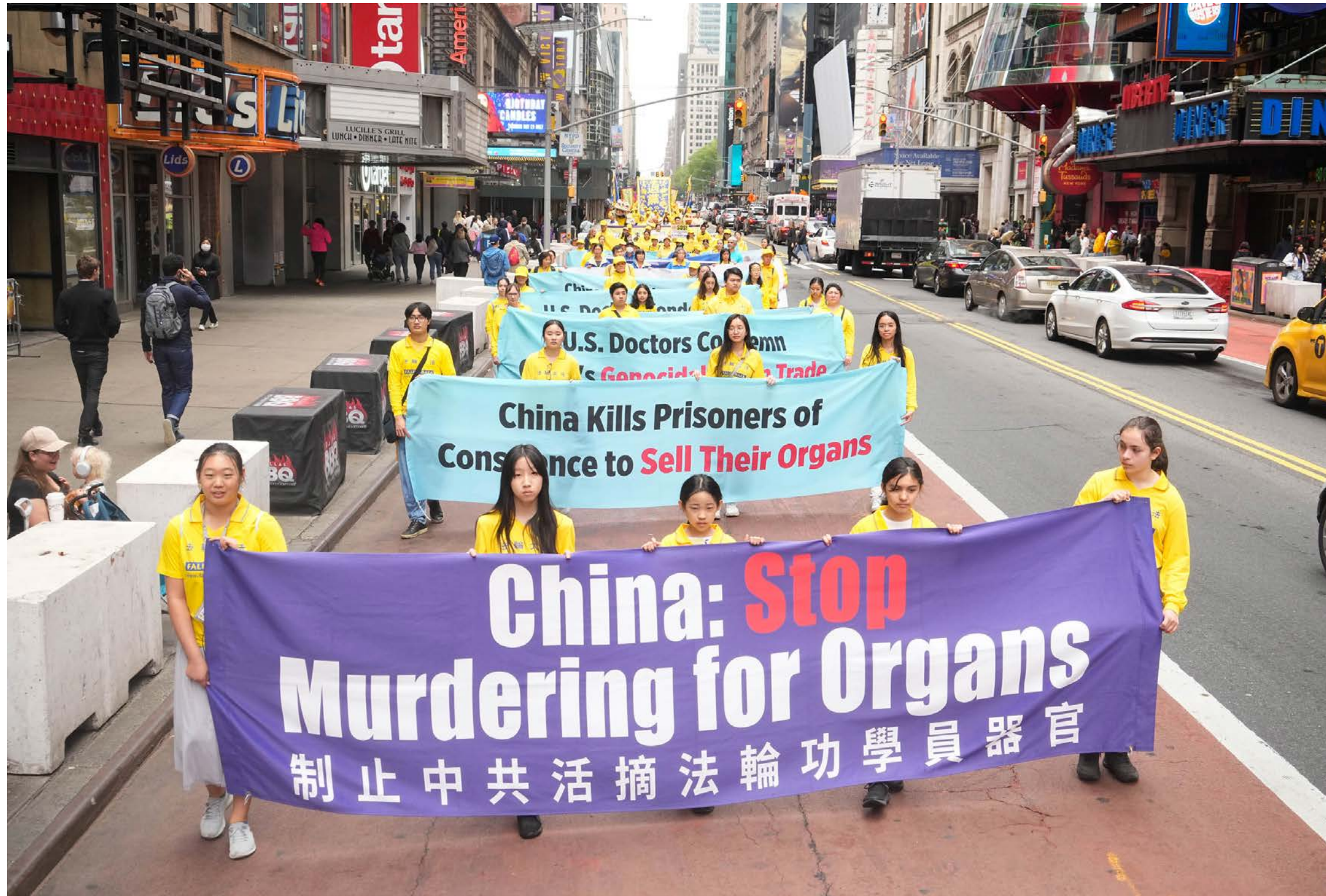
Falun Gong practitioners take part in a parade to raise awareness about organ harvesting in China, in New York on May 13, 2022.