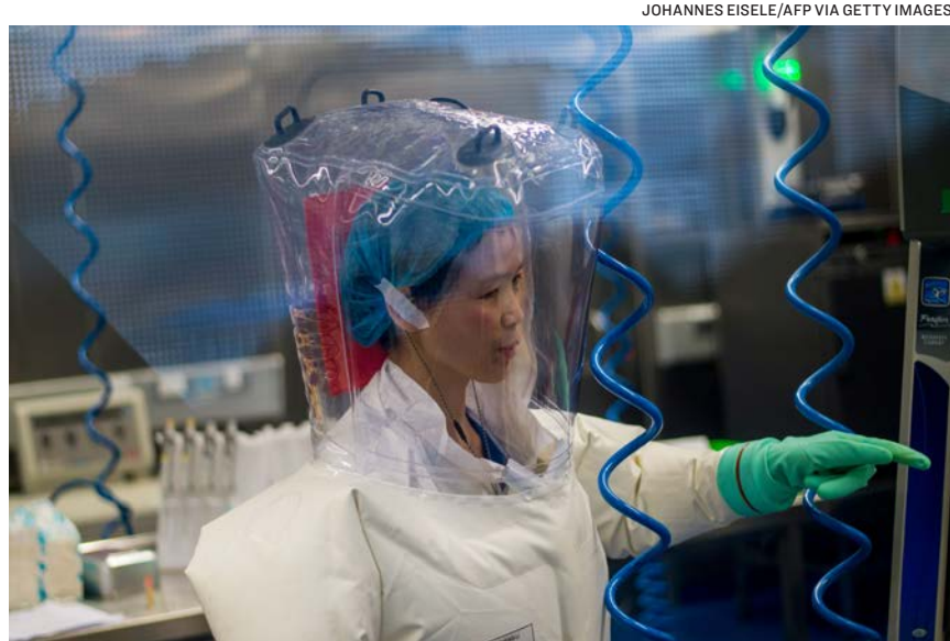
Chinese virologist Shi Zhengli inside the P4 laboratory in Wuhan, Hubei Province, China, on Feb. 23, 2017.