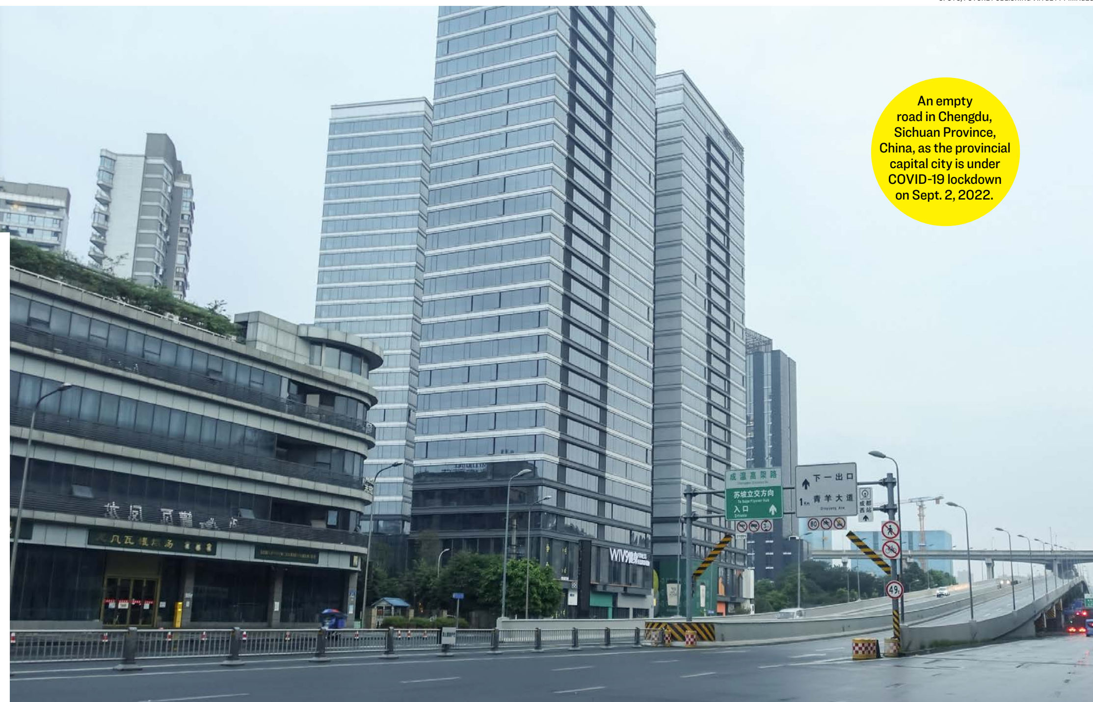
An empty road in Chengdu, Sichuan Province, China, as the provincial capital city is under COVID-19 lockdown on Sept. 2, 2022.