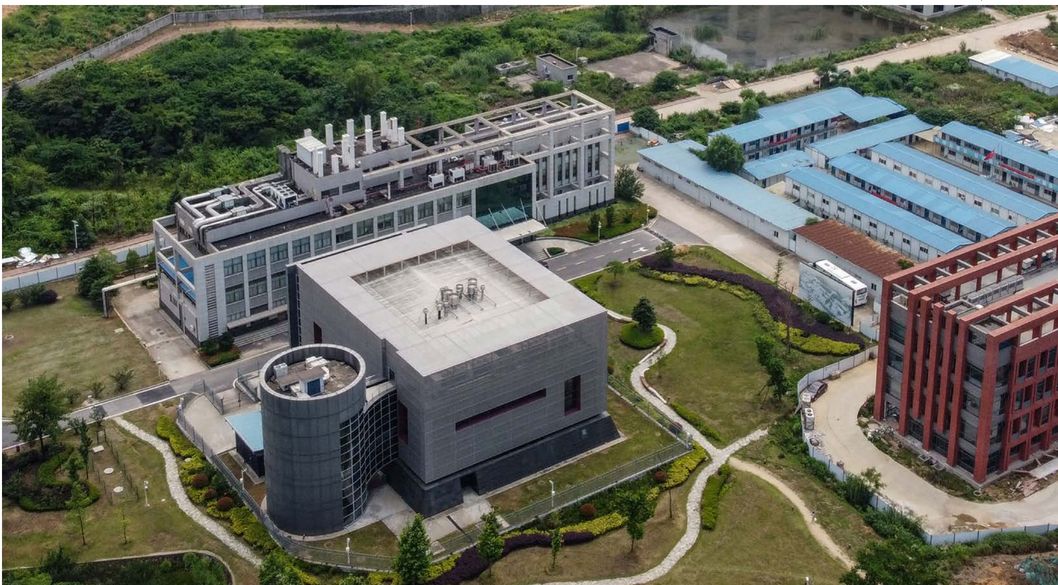
The P4 laboratory on the campus of the Wuhan Institute of Virology in Wuhan, Hubei Province, China, on May 27, 2020.