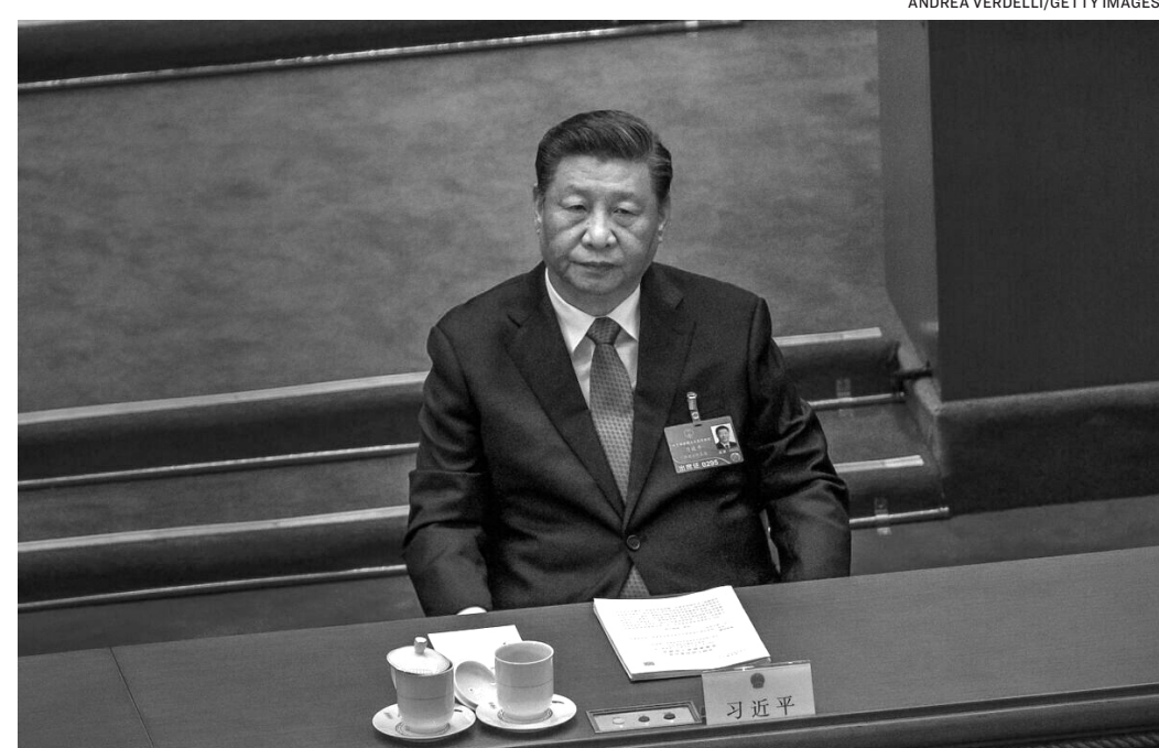
Chinese leader Xi Jinping during the Second Plenary Session of the Fifth Session of the 13th National People's Congress at the Great Hall of the People in Beijing on March 8, 2022.

The dual regulatory crackdowns in real estate and banking make sense because corruption may have permitted bankers and regulators to continue extending credit to developers. On the other hand, it may be that Xi is looking for a scapegoat. If the sector collapses, it will take much of the economy with it. As a result of the crackdowns, Xi will have a long list of people to blame. In the lead-up to the CCP's congress, it may also be that he feels the need to