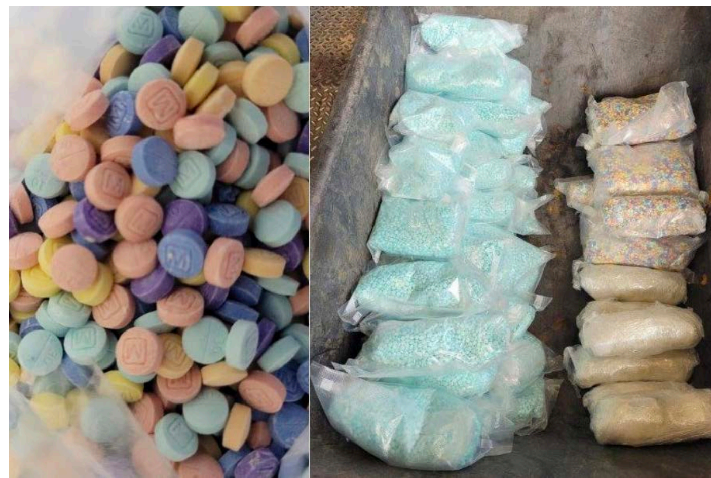
Fentanyl pills seized by Customs and Border Protection officers at the Nogales port of entry in Arizona on Sept. 3, 2022.