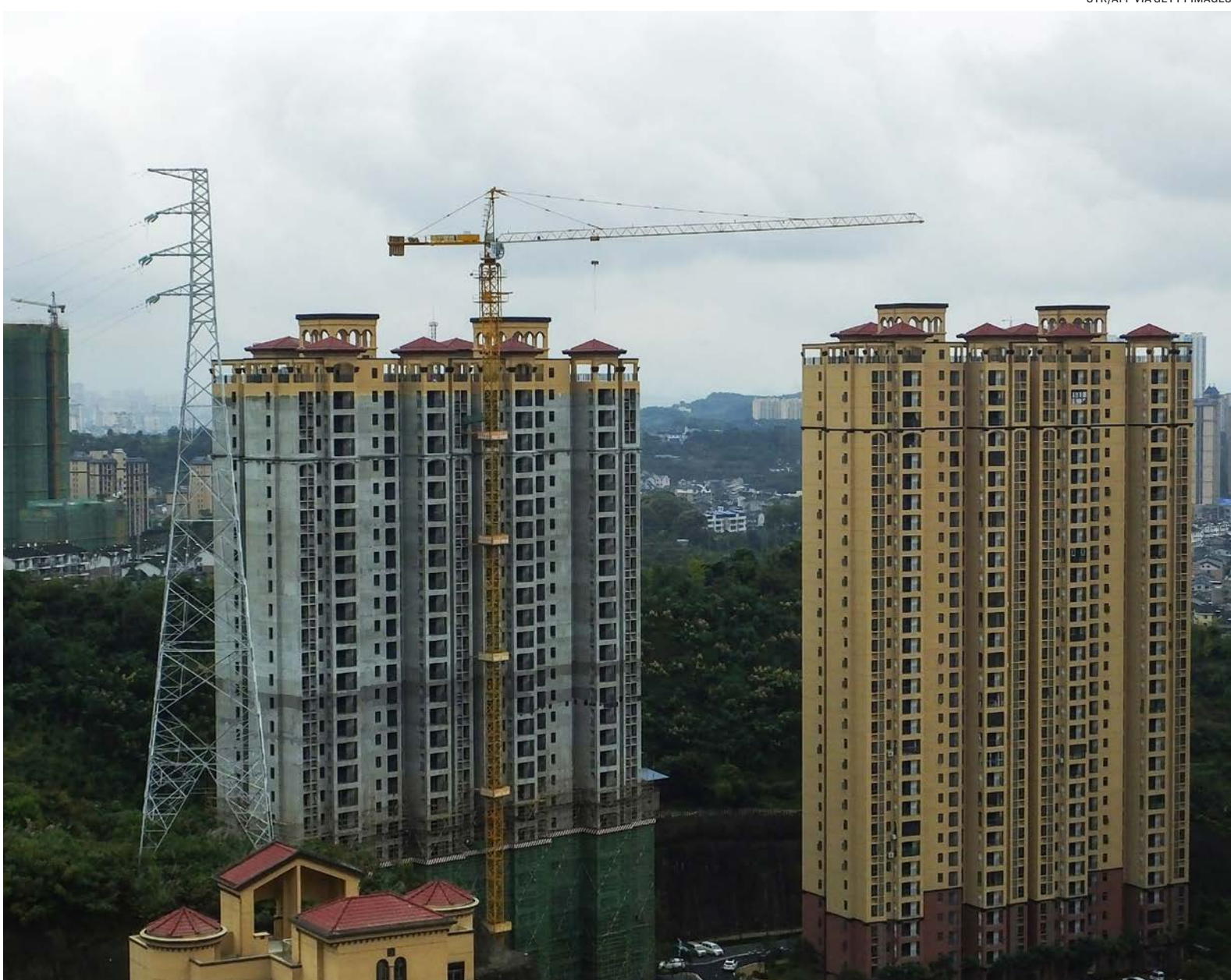
Residential buildings under construction are seen in Yichang, in central China's Hubei Province on Oct. 20, 2021.

The issue is rooted in China's "pre-sale" system, where buyers typically begin making payments to purchase an apartment before the apartment is built.