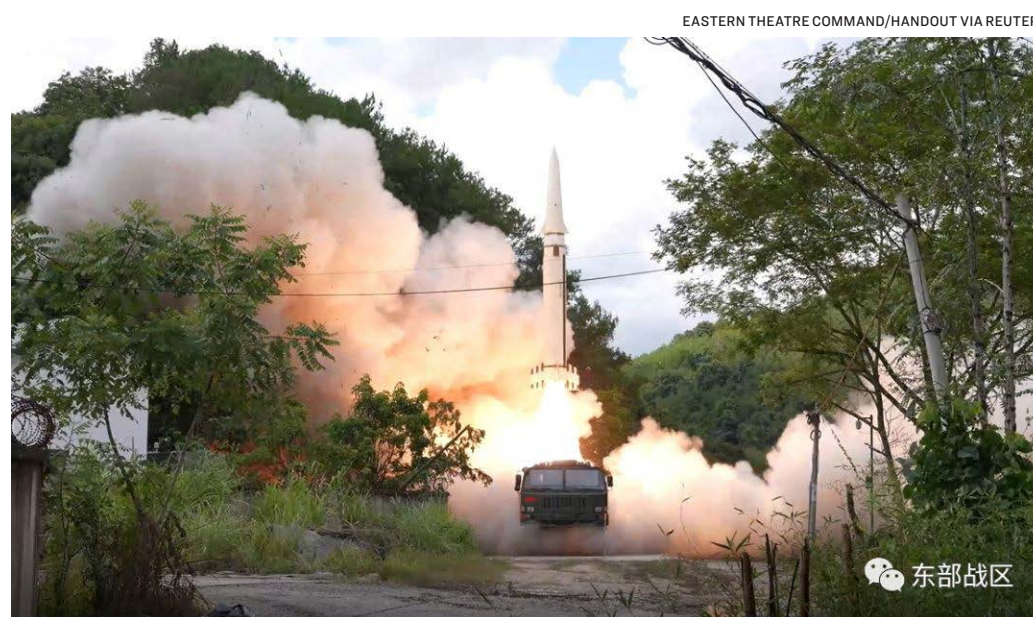
The rocket force under the Eastern Theatre Command of China's People's Liberation Army fires live missiles into the waters near Taiwan, from an undisclosed location in China on Aug. 4, 2022.

One notes that many officials handling Indo-Pacific affairs for Team Biden have "a history" with China—and don't exactly put the fear of God into the Chinese