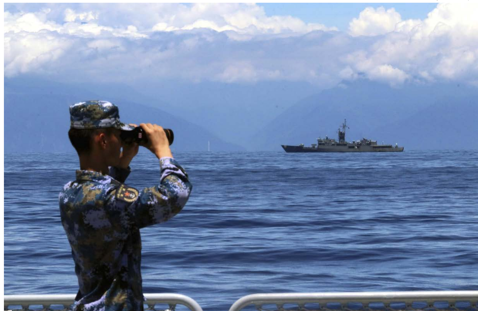
A People's Liberation Army member looks through binoculars during military exercises as Taiwan's frigate Lan Yang is seen in the background on Aug. 5, 2022.

And there is also the all-important question of "will"—that is, Beijing's perception of whether the Biden administration has the nerve/spine/fortitude/sang-froid to respond effectively as China makes its incremental moves against Taiwan. And the moves at some point will not be incremental as China