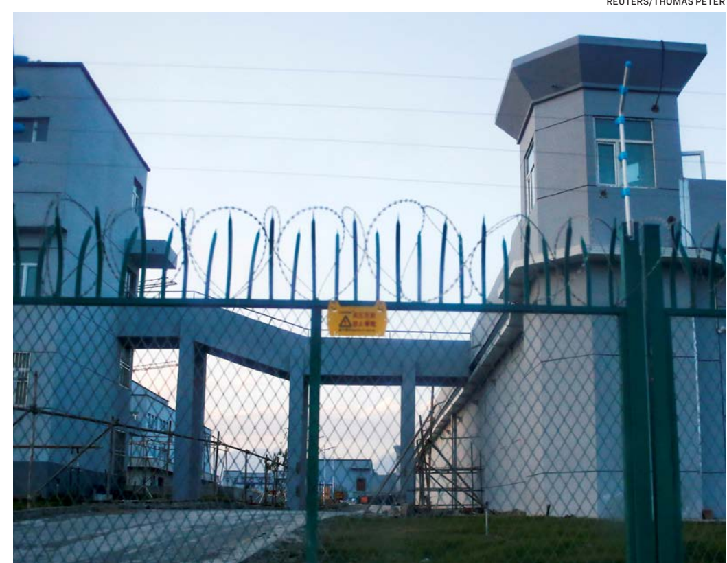
A perimeter fence is constructed around what is officially known as a vocational skills education center in Dabancheng in Xinjiang Uyghur region, China, on Sept. 4, 2018.

The loans are then used to pay Chinese companies to build infrastructure, including the development of roads, ports,