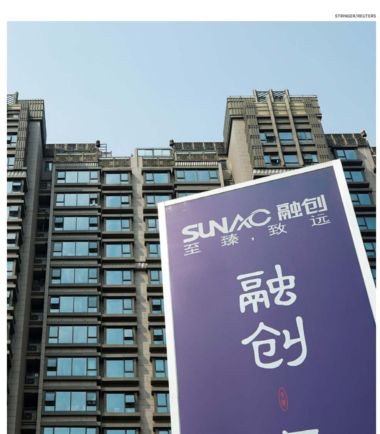
An advertisement of property developer Sunac China Holdings at a residential complex in Shanghai on March 25, 2018.

Views expressed in this article are the opinions of the author and do not necessarily reflect the views of The Epoch Times.