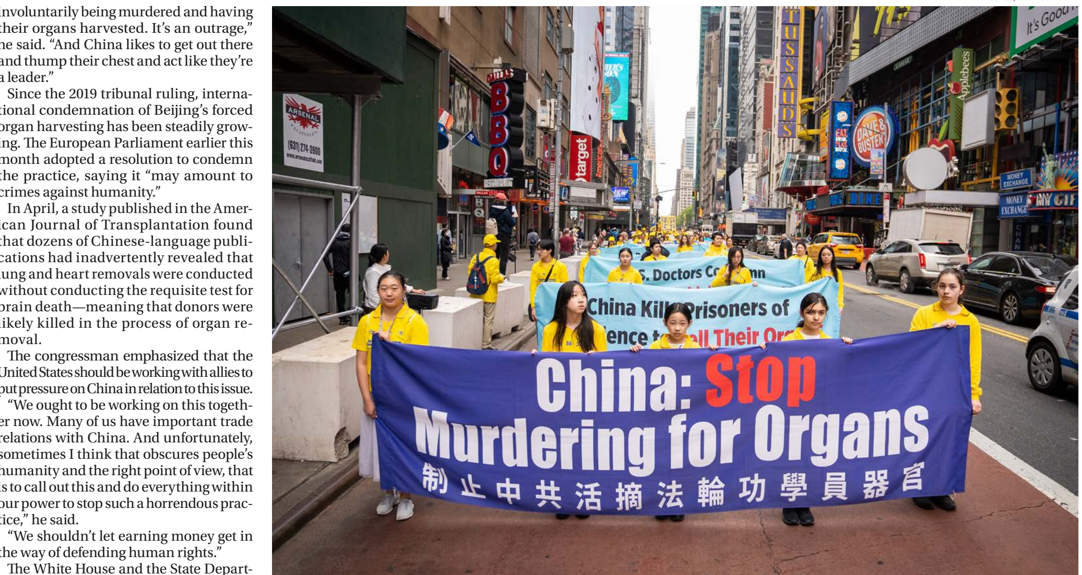
Falun Gong practitioners take part in a parade marking the 30th anniversary of the spiritual discipline's introduction to the public, in New York on

"We shouldn't let earning money get in the way of defending human rights." The White House and the State Department didn't respond to requests for comment by press time.