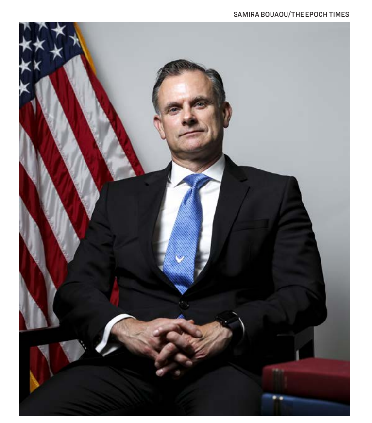
Retired Air Force Brig. Gen. Robert Spalding in Washington on

reputation of politicians as well as coopt individual influential civilian social media users to extend the reach of Chinese propaganda while obfuscating its Party origins."