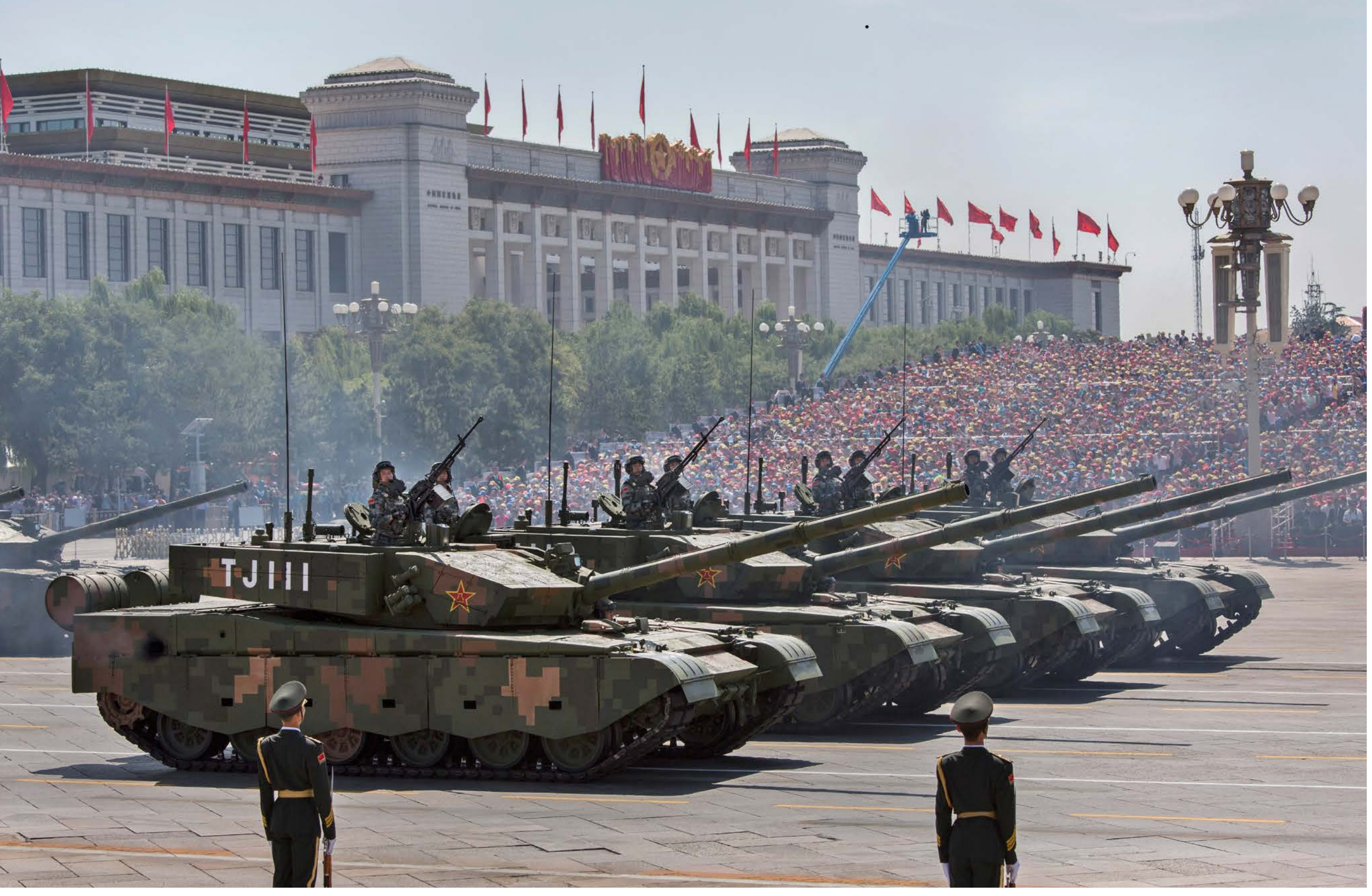
cal operations such as "Ghosts in the Chinese soldiers ride in tanks as they pass in front of Tiananmen Square and the Forbidden City during a military parade in Beijing on Sept. 3, 2015.

It's a psychological campaign of unrestricted hybrid warfare perpetrated by the Chinese Communist Party (CCP) with the purpose of eradicating the United States' will to defend itself and preserve democratic values.