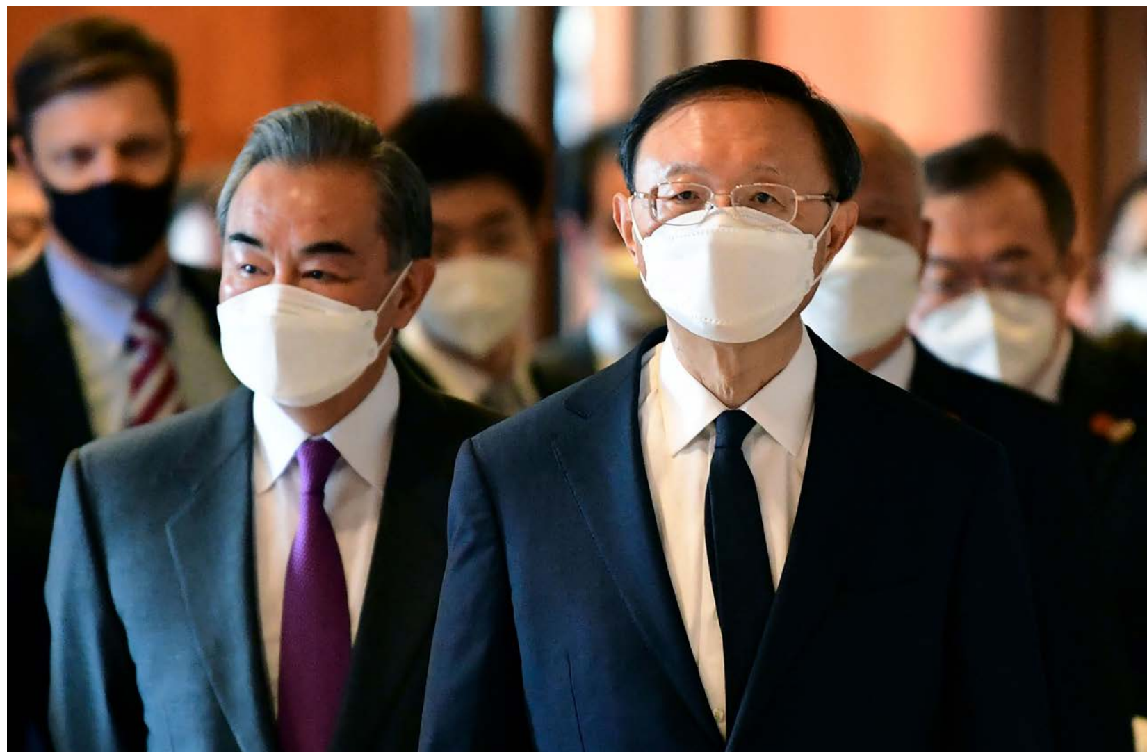
Yang Jiechi (R), the director of the Central Foreign Affairs Commission Office of the Chinese Communist Party, and Wang Yi (L), China's foreign minister, arrive for a meeting with U.S. counterparts at the opening session of the U.S.–China talks at the Hotel Captain Cook in Anchorage, Alaska, on March 18, 2021.