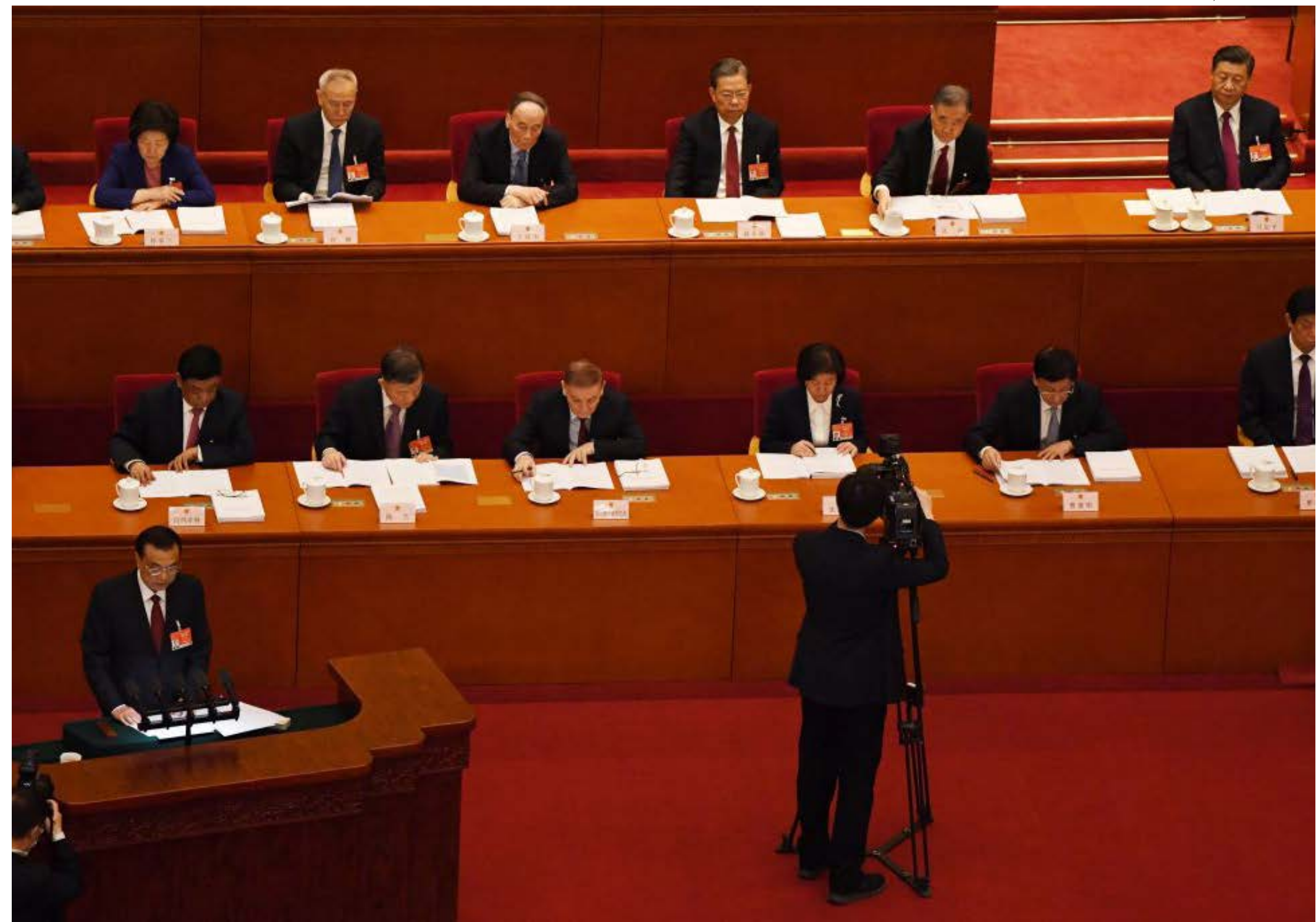
Chinese Premier Li Keqiang (bottom L) reads his work report, proposing "in-depth planning to promote 'Science and Technology Innovation 2030'" during the opening session of the rubber-stamp legislature in Beijing on March 5, 2021.