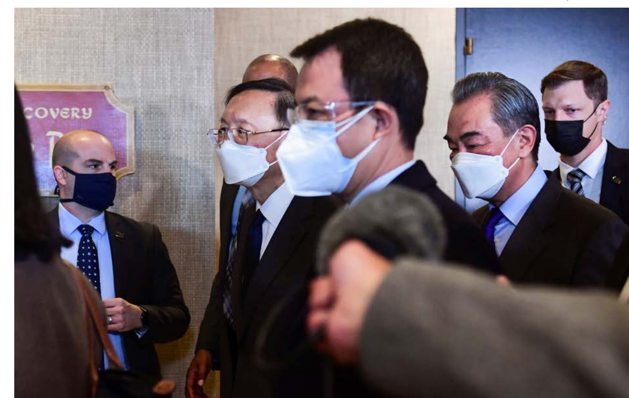
The Chinese delegation led by Yang Jiechi (2nd L), the director of the Central Foreign Affairs Commission Office of the Chinese Communist Party and China's state councilor and foreign minister, Wang Yi (2nd R) depart the ballroom at the conclusion of talks between the United States and China in Anchorage, Alaska, on March 19, 2021.