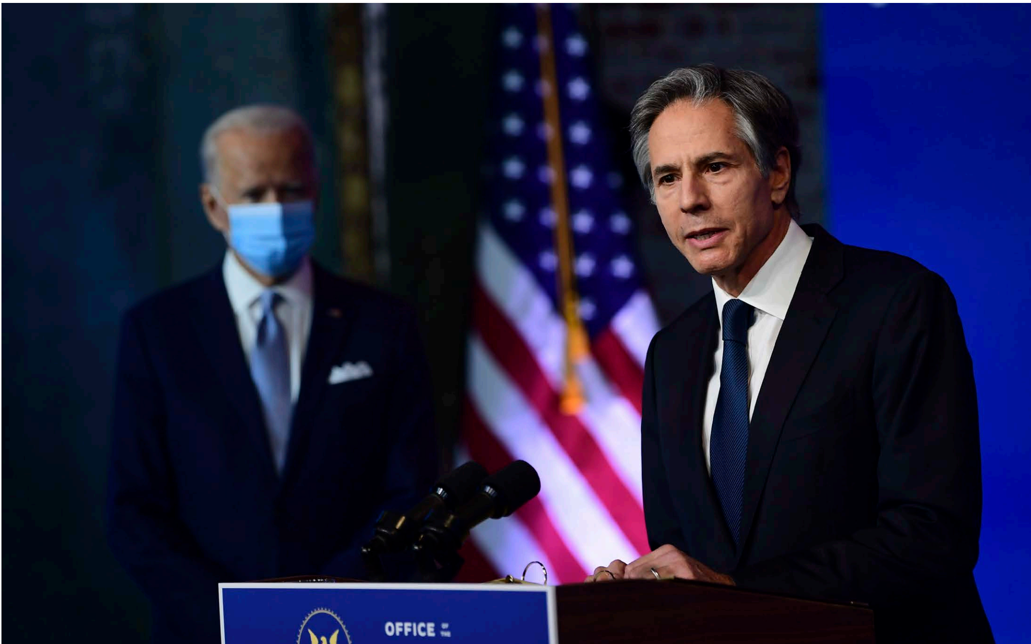
Then-Secretary of State nominee Antony Blinken speaks after being introduced by President-elect Joe Biden at the Queen Theatre in Wilmington, Del., on Nov. 24, 2020.