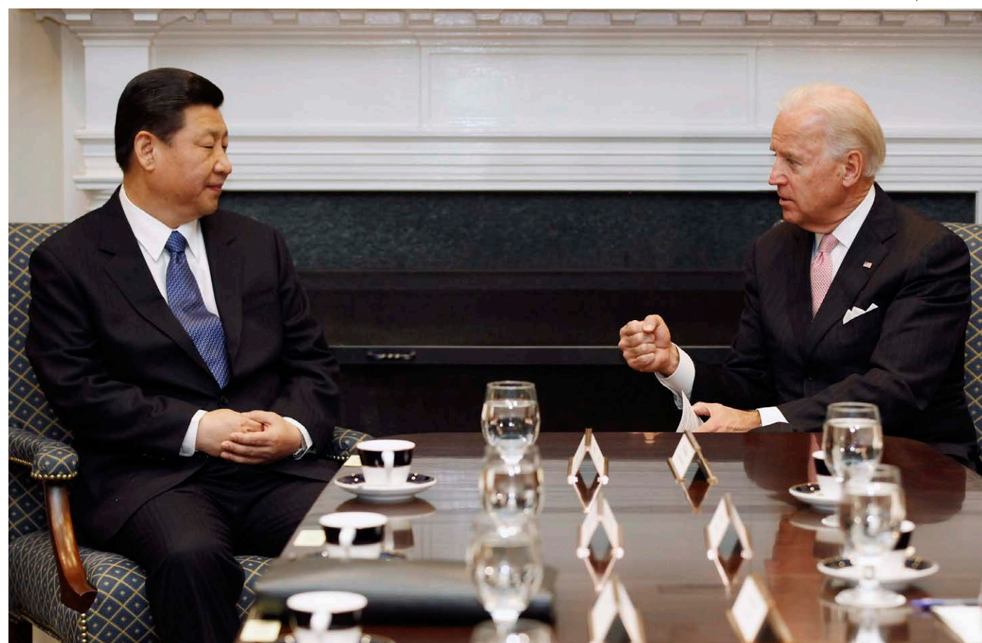
Then-Vice President Joe Biden and then-Vice Chair Xi Jinping talk during an expanded bilateral meeting with other U.S. and Chinese officials in the Roosevelt Room at the White House in Washington on Feb. 14, 2021.

Behind the huge trade deficit numbers, there is a direct threat to the basic livelihood of the United States, and it has led to a high unemployment rate. The CCP continues to acquire U.S. dollars to expand its armaments, expand the “Belt and Road” Initiative, and exert influence in the international arena.