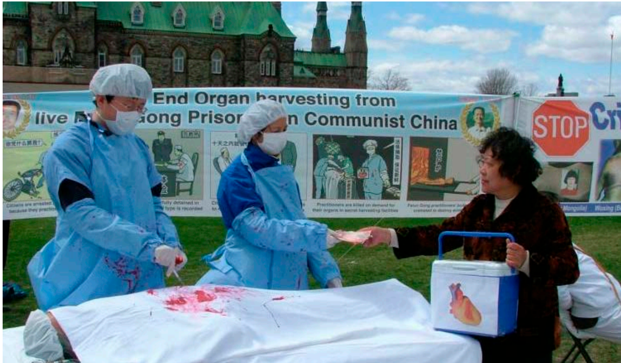
Falun Gong practitioners enact a scene of organ harvesting in China.