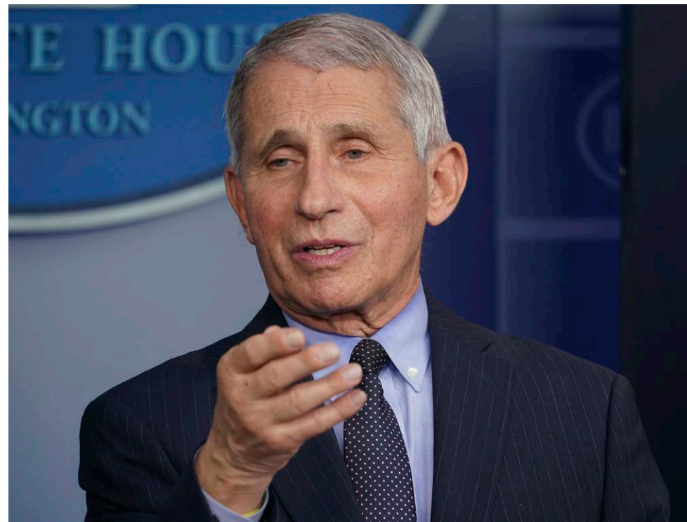
Director of the National Institute of Allergy and Infectious Diseases Anthony Fauci speaks during the daily briefing in the Brady Briefing Room of the White House in Washington on Jan. 21, 2021.