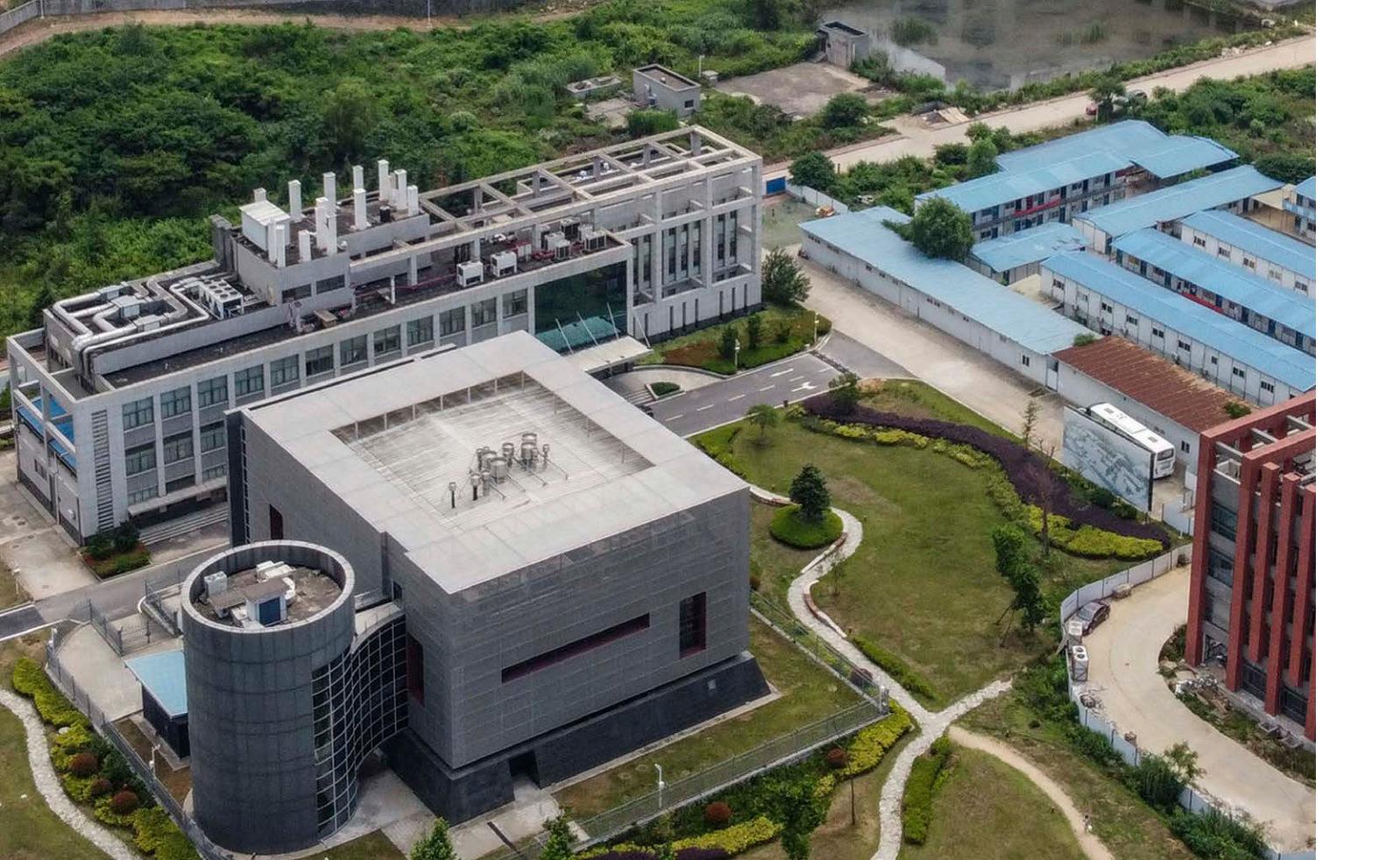
An aerial view of the P4 laboratory (L) on the campus of the Wuhan Institute of Virology in Hubei Province on May 27, 2020