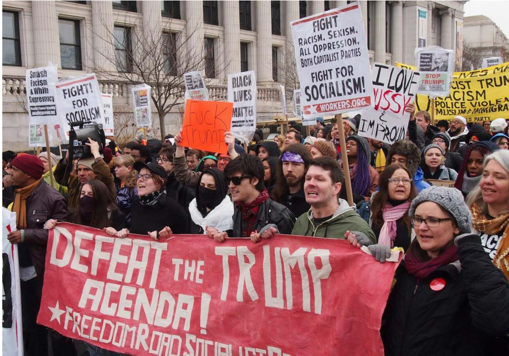
Freedom Road Socialist Organization supporters during an anti-Trump march in Washington on Jan. 20, 2017.