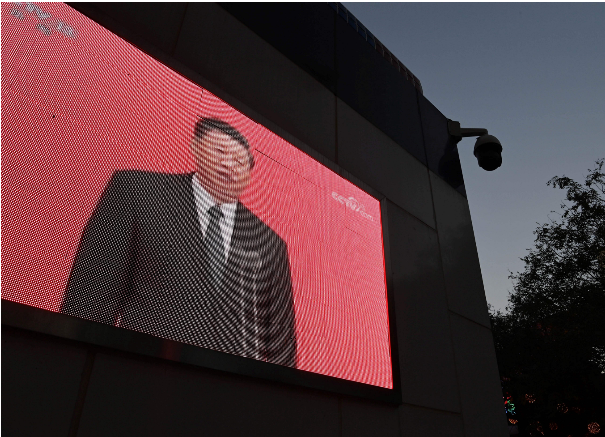
A video clip of Chinese leader Xi Jinping is seen on the outside of a police patrol station in Beijing on Nov. 2, 2020.