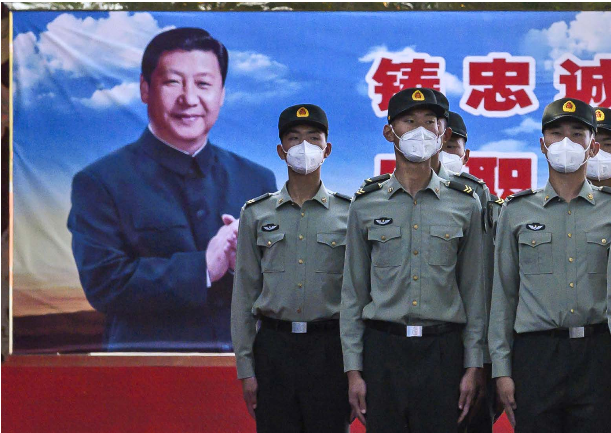
Soldiers of the People's Liberation Army's Honor Guard Battalion wear protective masks as they stand at attention in front of a photo of Chinese Communist Party leader Xi Jinping at their barracks outside the Forbidden City in Beijing on May 20, 2020.