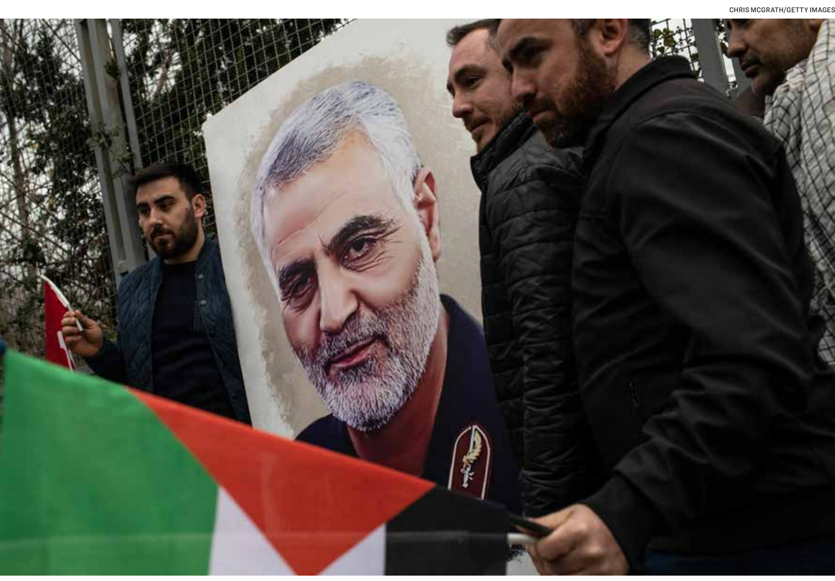
People hold posters showing the portrait of Iranian Revolutionary Guard Maj. Gen. Qassem Soleimani during a protest outside the U.S. Consulate in Istanbul, Turkey, on Jan. 5, 2020