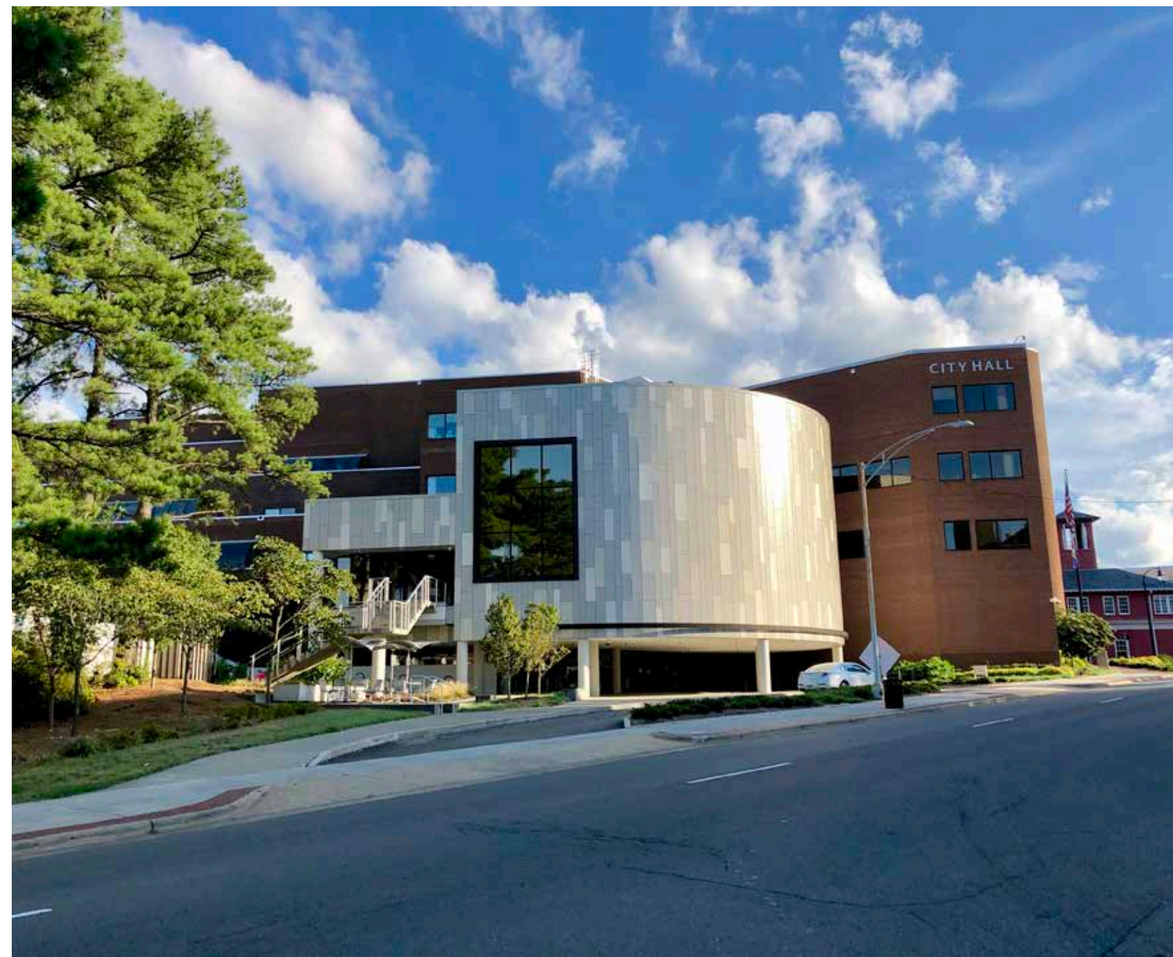
WARREN LEMAY/DURHAM CITY HALL, DURHAM, NC VIA WIKIMEDIA COMMONS

Durham City Hall, Durham, NC, Sept. 1, 2019. Now, five of the six City Council seats, plus the mayoralty, are held by leftists backed by the Liberation Road/FRSO and the Durham People's Alliance (DPA).