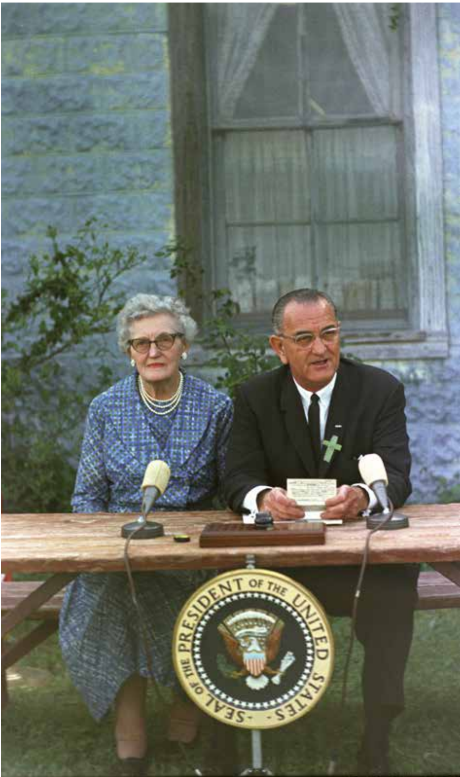
President Lyndon B. Johnson signing the Elementary and Secondary Education Act on April 11, 1965.

Well-educated Americans would have instantly recognized the absurdity of the ruling. After all, when the First Amendment was written and ratified, most of the states had established churches. The idea that this amendment, designed to prevent a national