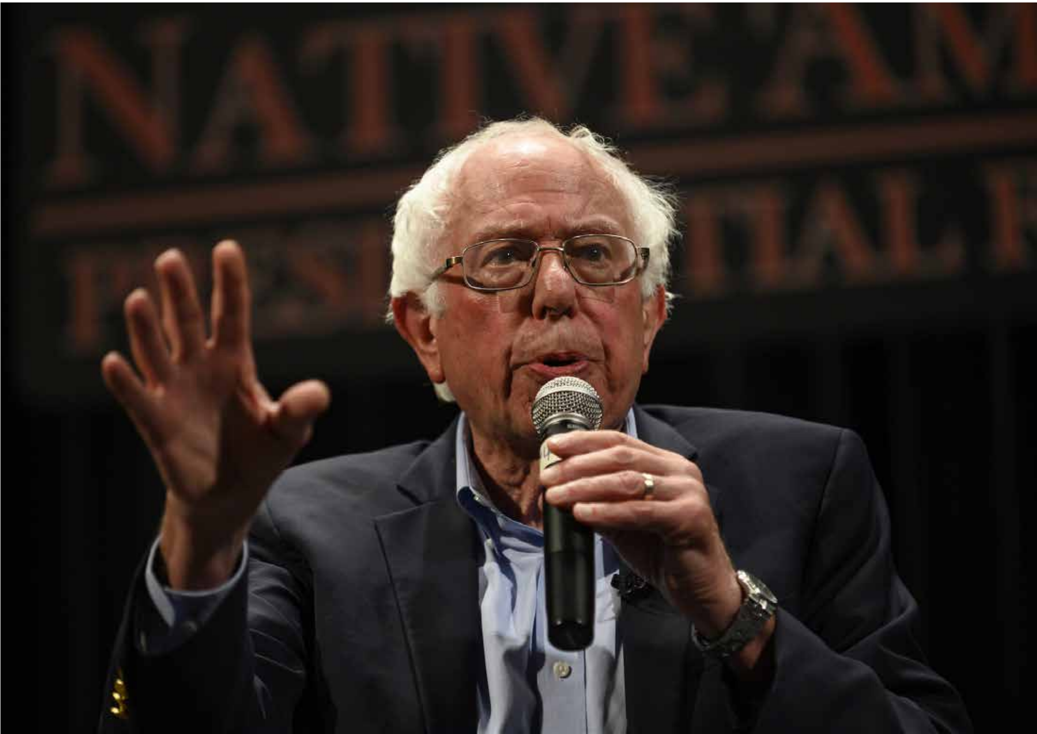
Democratic presidential candidate Sen. Bernie Sanders (I-VT) speaks at the Frank LaMere Native American Presidential Forum in Sioux City, Iowa, on Aug. 20, 2019.