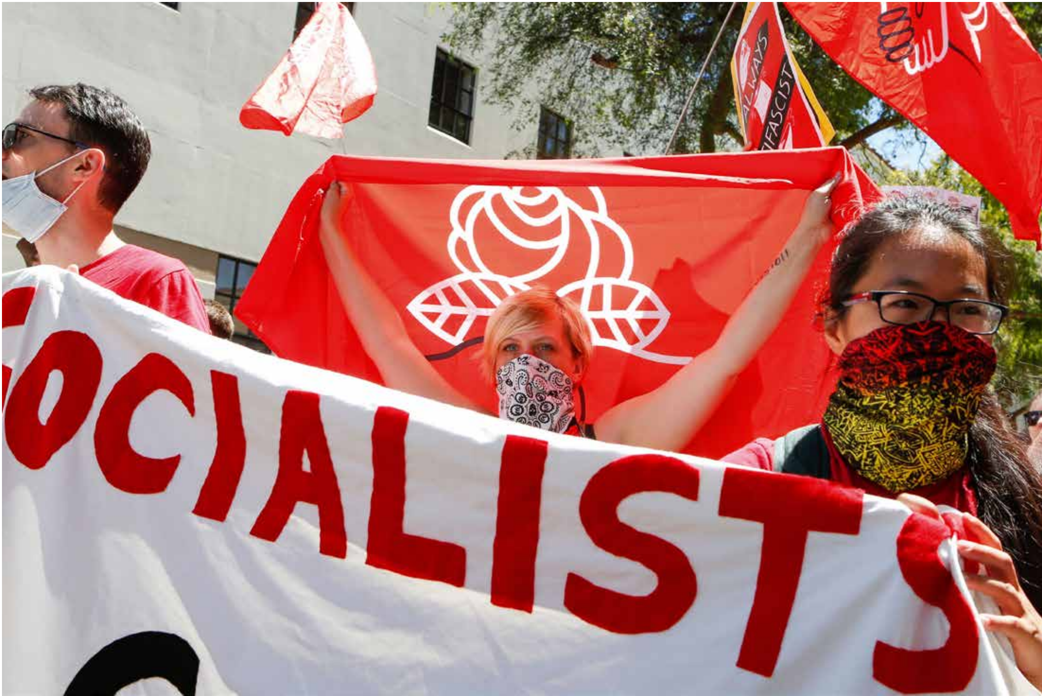
Democratic Socialists of America march in downtown Berkeley, Calif., on Aug. 5, 2018.