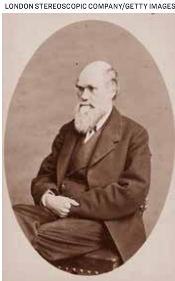
English naturalist Charles Darwin (1809-1882) who constructed the theory of evolution.

Views expressed in this article are the opinions of the author and do not necessarily reflect the views of The Epoch Times.