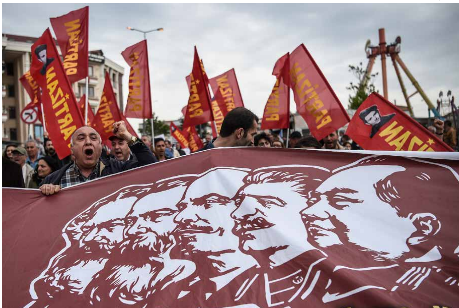
People hold a banner picturing Communist figures including (L-R) Karl Marx, Friedrich Engels, Vladimir Lenin, Joseph Stalin, and Mao Zedong, as they gather in Bakirkoy district as part of the May Day rally in Istanbul on May 1, 2017.