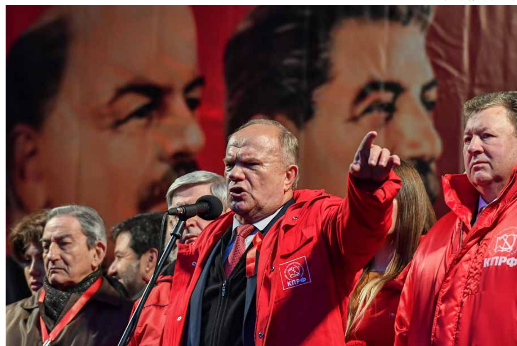
Communist Party leader Gennady Zyuganov gives a speech during a rally marking the 100th anniversary of the 1917 Bolshevik Revolution in Moscow on Nov. 7, 2017.

It's very easy for the world communist movement to be confident of victory when the vast majority of their intended victims don't even know that the threat still exists.