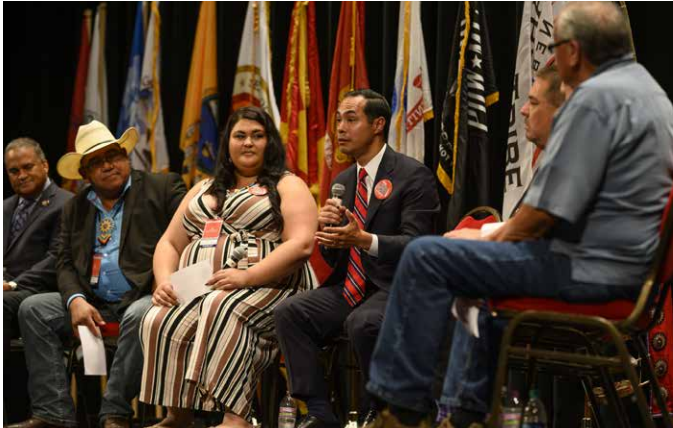
Democratic presidential candidate and former Housing and Urban Development Secretary Julian Castro speaks at the Frank LaMere Native American Presidential Forum in Sioux City, Iowa, on Aug. 20, 2019.

At just over 2 percent of the population, the Native American vote could be enough to swing several key U.S. Senate races and even the presidency.