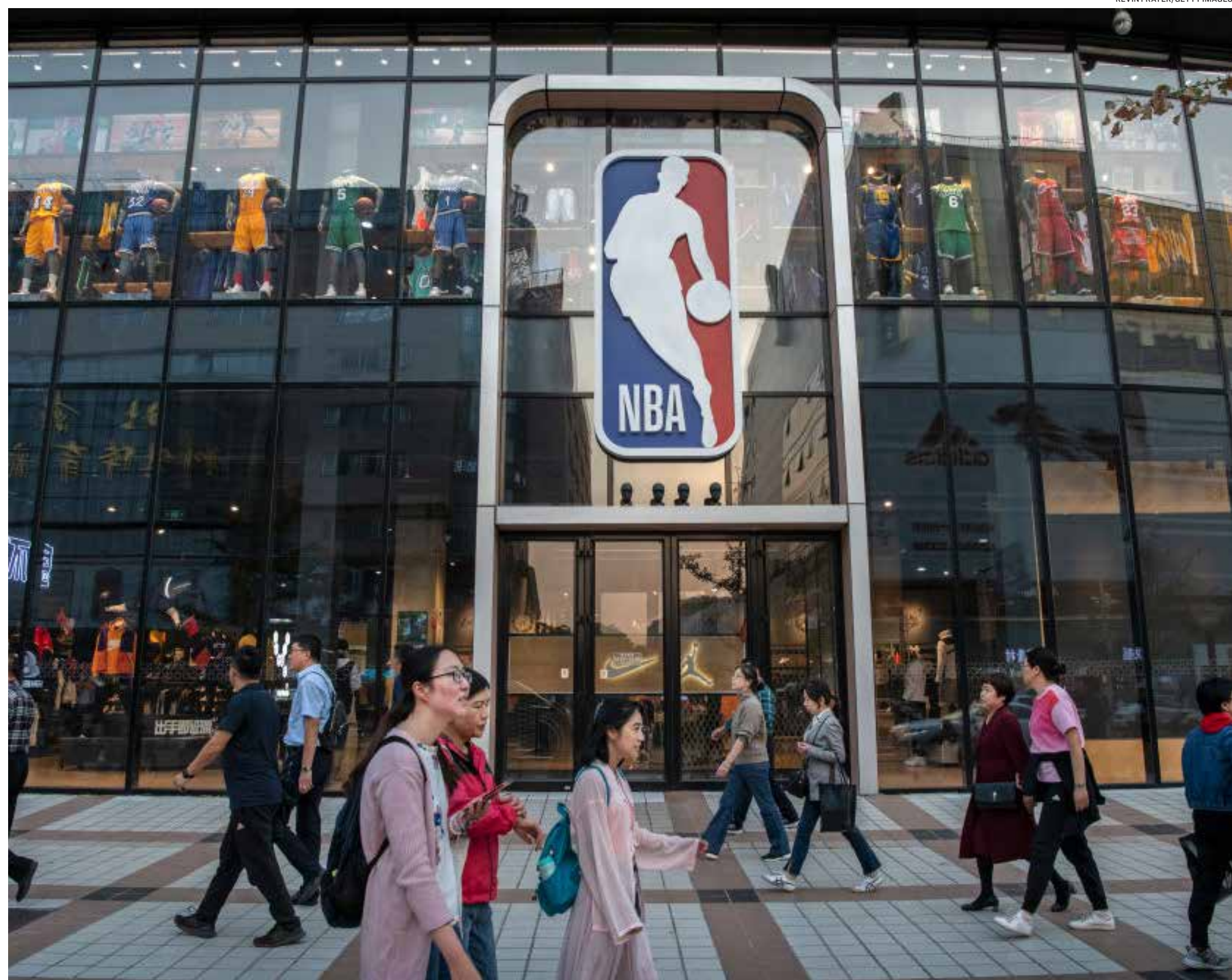
People walk by the NBA flagship retail store in Beijing on Oct. 9, 2019.

Views expressed in this article are the opinions of the author and do not necessarily reflect the views of The Epoch Times.