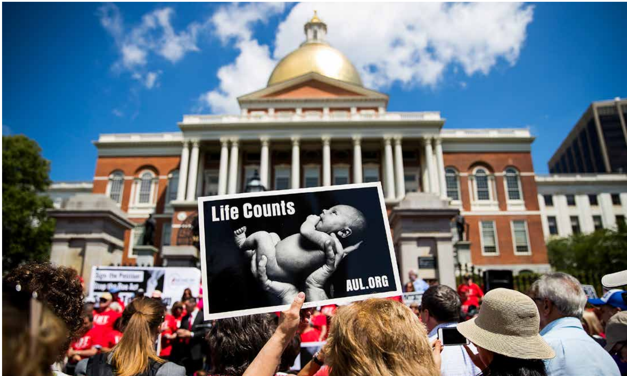
Supporters of Massachusetts Citizens for Life hold during a rally outside the Massachusetts Statehouse in Boston, on June 17, 2019.