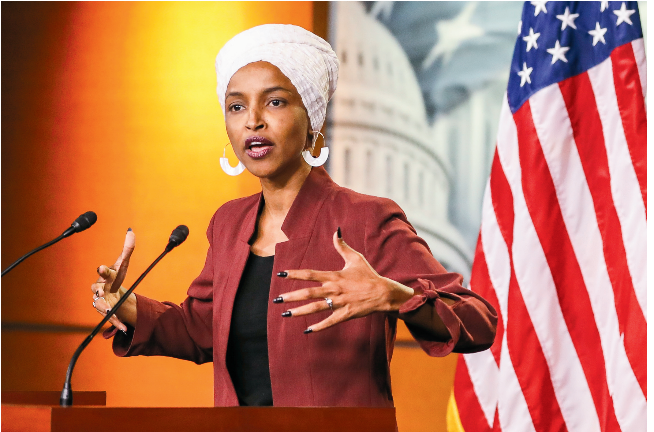
Rep. Ilhan Omar (D-Minn.) speaks at a press conference at the Capitol on July 15, 2019.