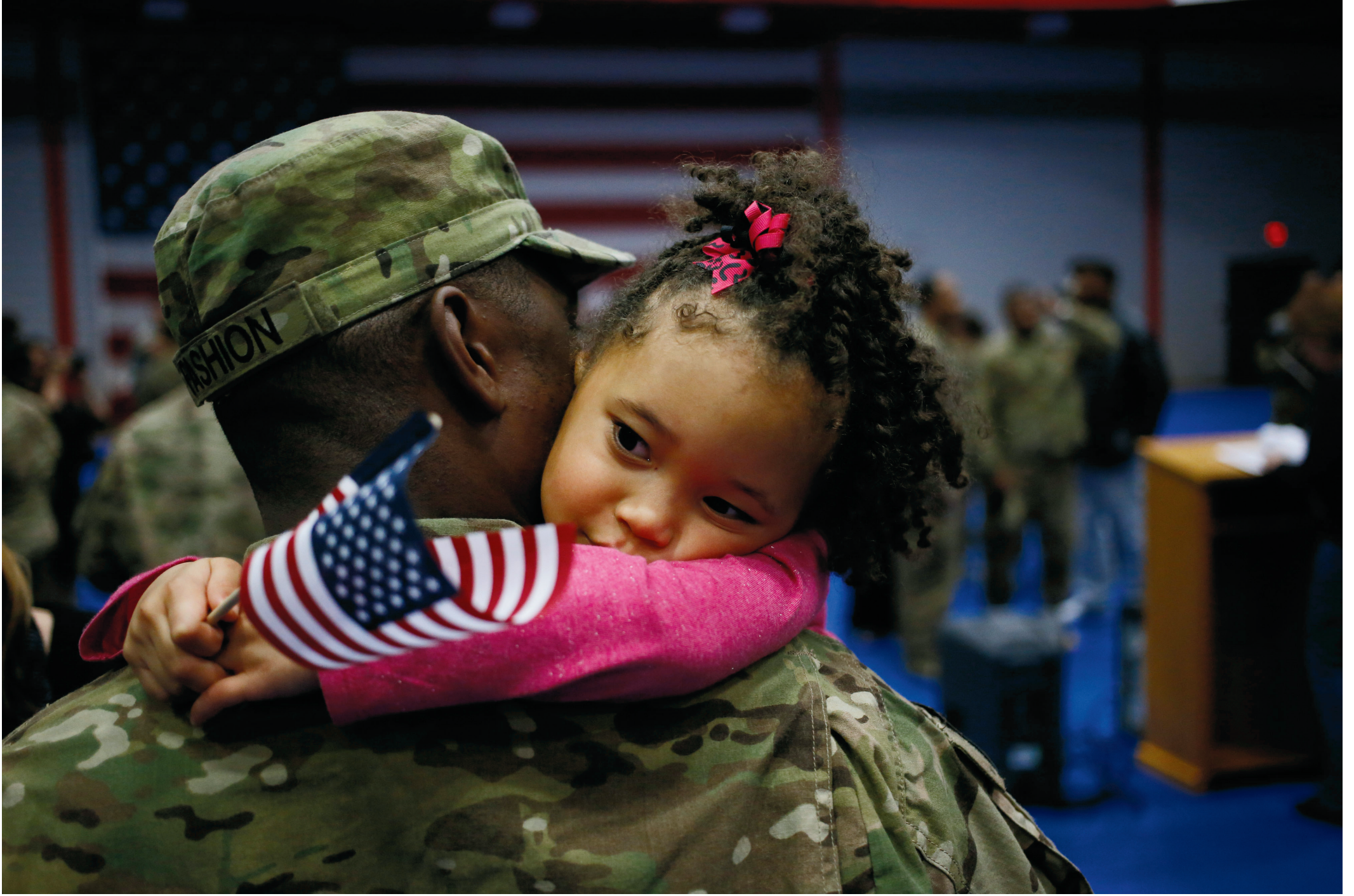
It is temperance that allows us to remain focused on the needs of others rather than on our self-perceived needs.