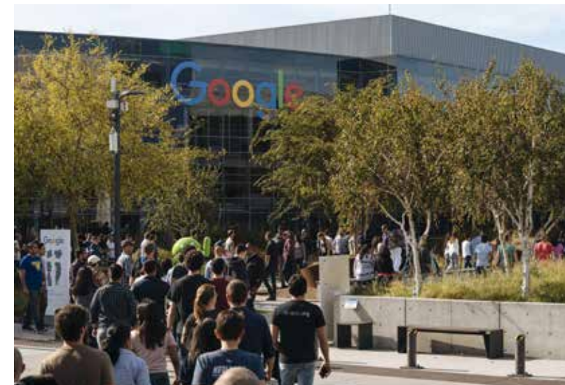
Employees walk out of Google’s headquarters to protest the companies handling of sexual misconduct allegations, in Mountain View, Calif., on Nov. 1, 2018.

and plagiarized version of the discovery of America, and trained them in conducting an “Abolish Columbus Day” campaign in the classroom. The National Endowment for the Arts supported the Kronos Festival, where Zinn’s “penetrating words” were used to “unite music with energized action.”