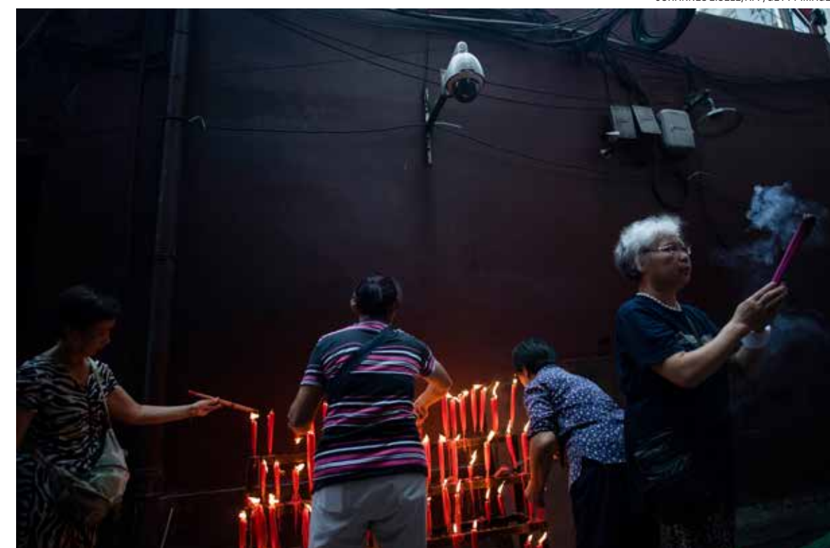
People burn incense under a surveillance camera at the back of a temple in China on Aug. 25, 2018.