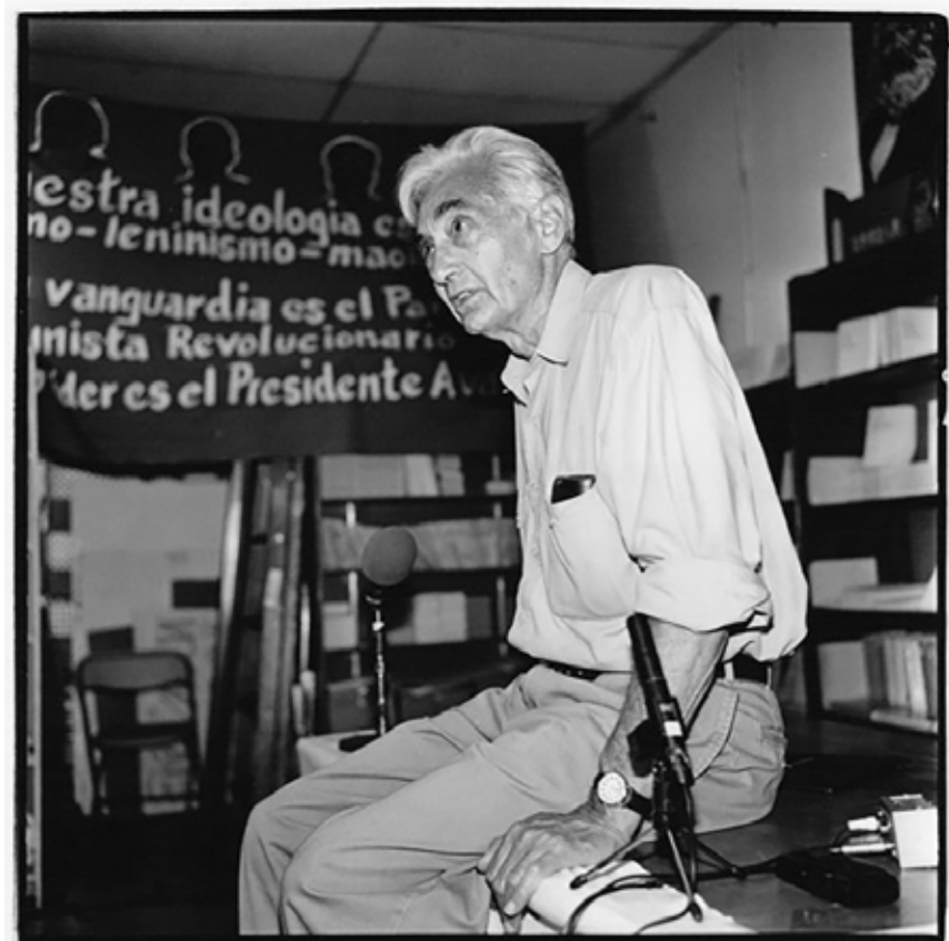
SLOBODANIMITROVIC/CC BY-SA 4.0