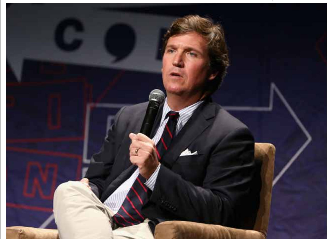
Tucker Carlson during the Politicon 2018 at the Los Angeles Convention Center on Oct. 21, 2018. It isn't conservatives who go back many years through someone's tweets or interviews in search of evidence that will get that person fired or banned, as leftists did with Carlson.