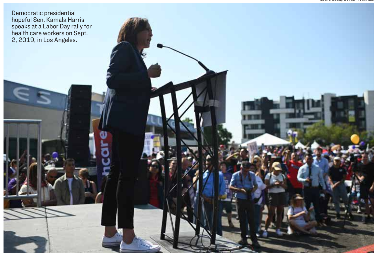
Democratic presidential hopeful Sen. Kamala Harris speaks at a Labor Day rally for health care workers on Sept. 2, 2019, in Los Angeles.

A solid record of left-leaning service won't shield a liberal from attack if the liberal wavers.