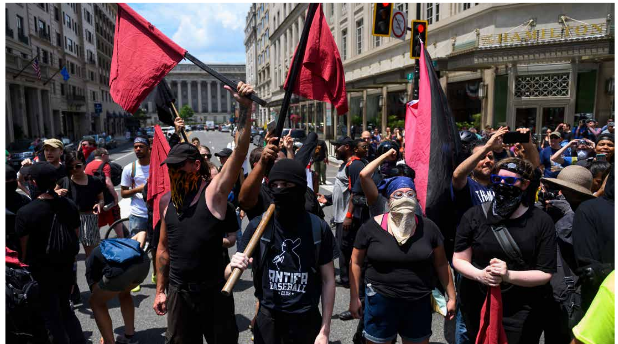
Members of Antifa march in Washington on July 6, 2019.

Views expressed in this article are the opinions of the author and do not necessarily reflect the views of The Epoch Times.