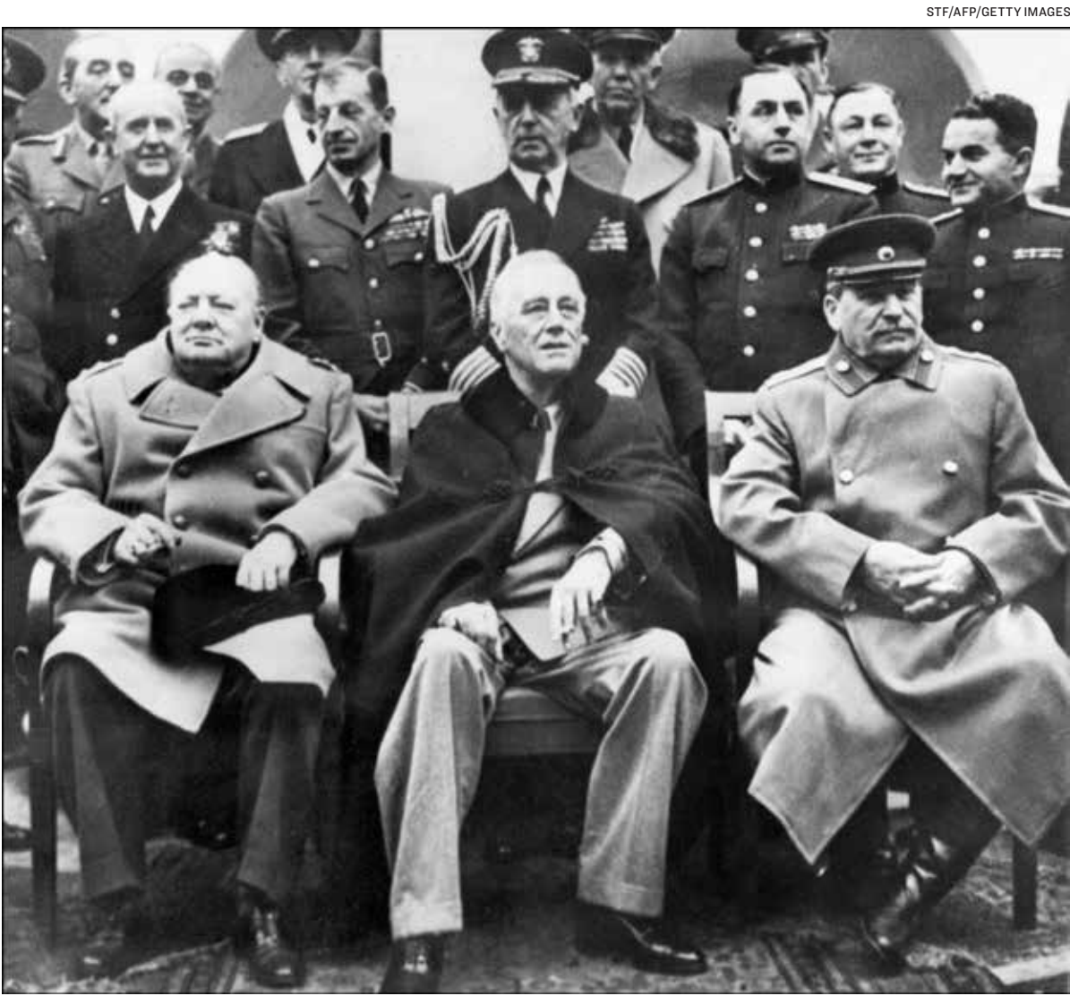
British Prime minister Winston Churchill (L), US president Franklin Delano Roosevelt (C) and Secretary general of the Soviet Communist Party Joseph Stalin (R) pose at the start of the Conference of the Allied powers in Yalta, Crimea, on Feb. 4, 1945.

Not surprisingly, when some of this testimony became public in 1948, the U.S. government attempted a coverup. Rather than expelling communist agents from sensitive government jobs, the Truman administration wanted to prosecute Chambers for perjury. Meanwhile, Bentley’s testimony, which was given to a grand jury over a period of several months,