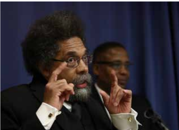
Cornel West, honorary chair of the DSA, speaks at the National Press Club in Washington on Feb. 21, 2017.

of the Laboring Masses), both of which were founded by former leaders of the Maoist terror group Communist Party of the Philippines/New People's Army.