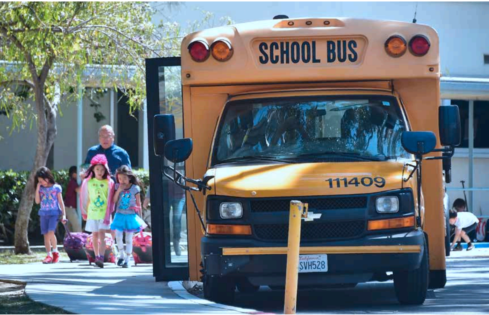
Children walk by a school bus in Monterey Park, Calif., on April 28, 2017.