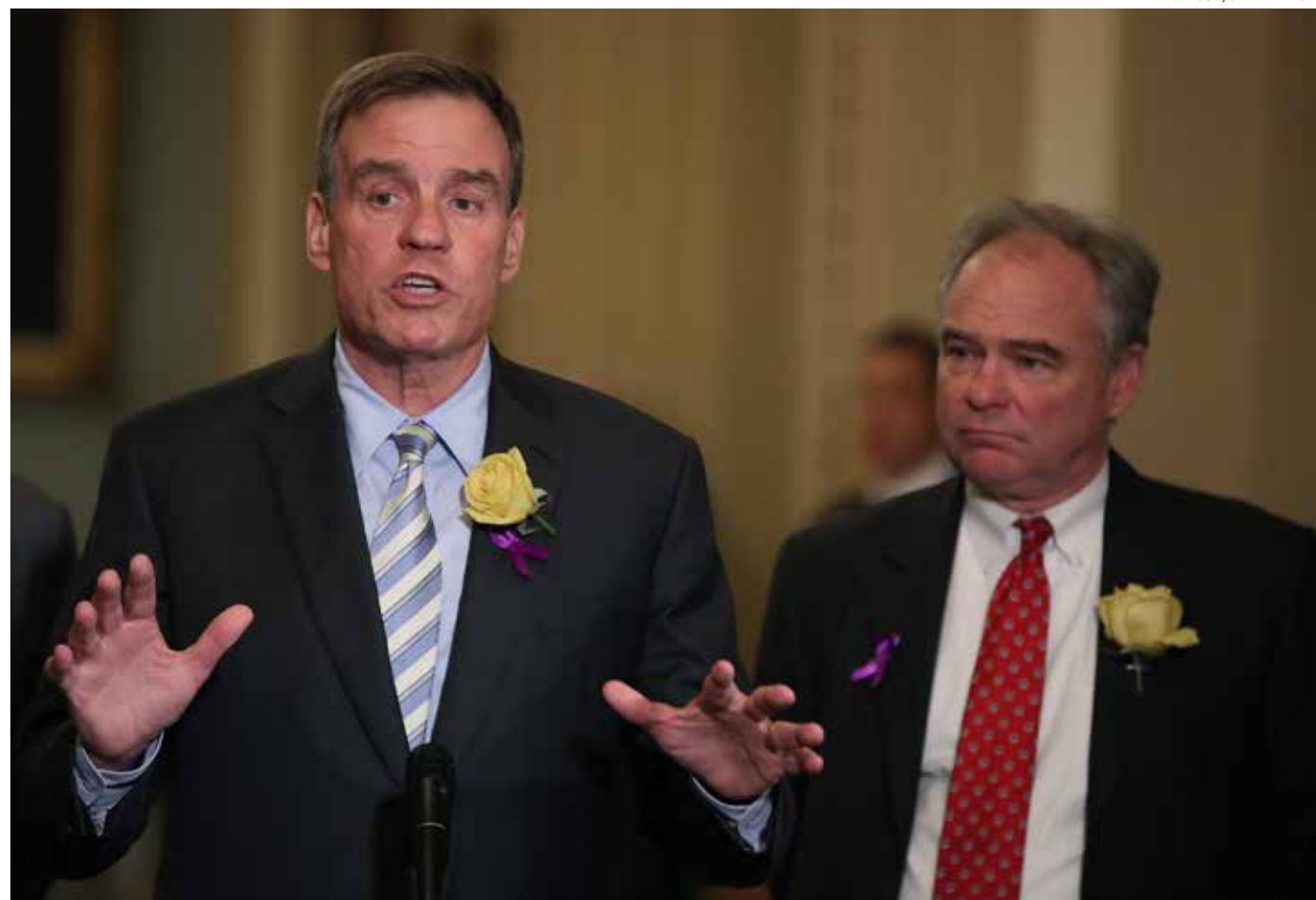
Sen. Mark Warner (D-Va.) on Capitol Hill on June 4, 2019.

In addition to students from China, there were 44,000-plus Saudis, 18,000-plus Venezuelans, almost 13,000 Iranians, 10,000