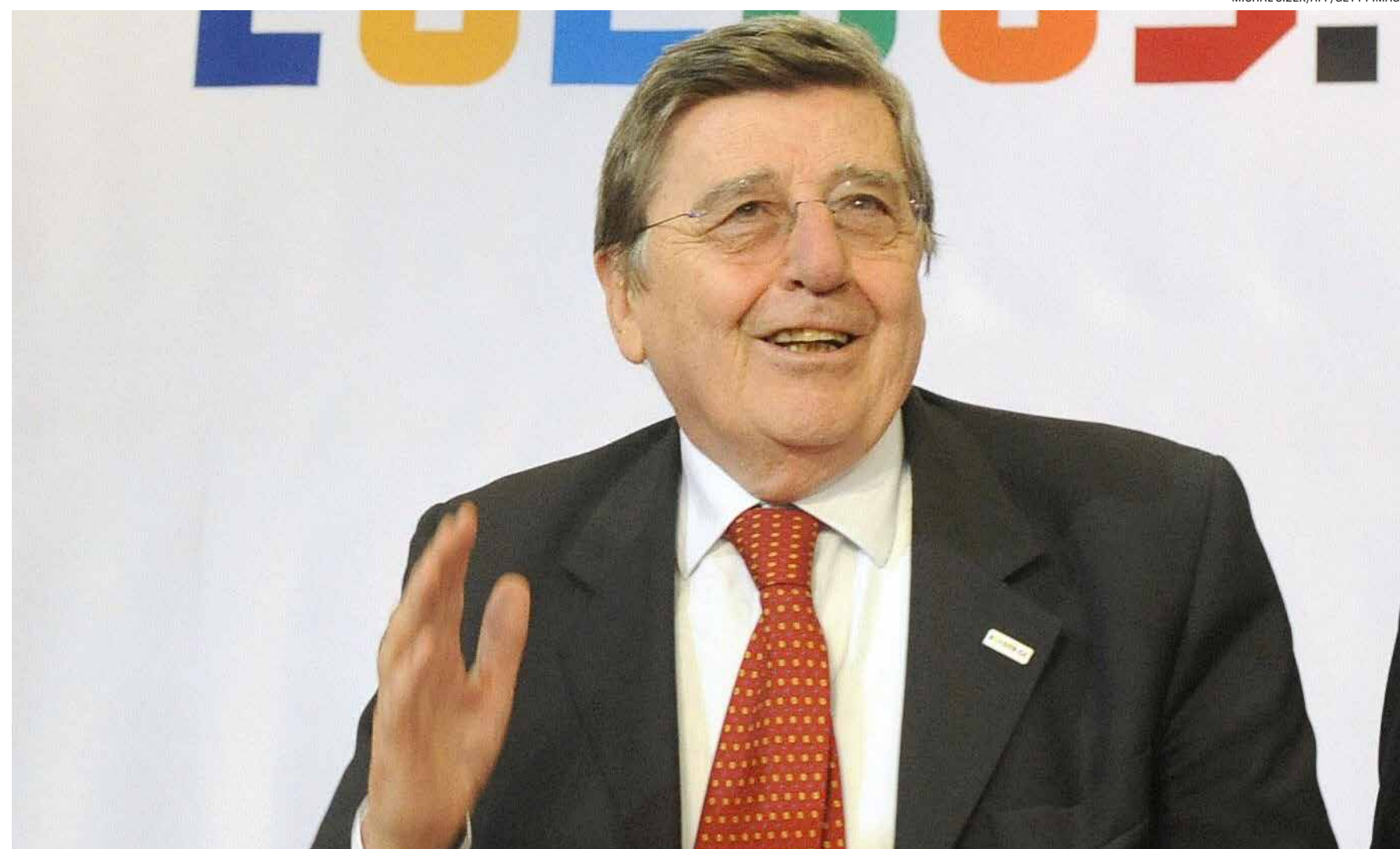
Vincenzo Scotti, former Italian interior minister, in Prague on May 13, 2009.