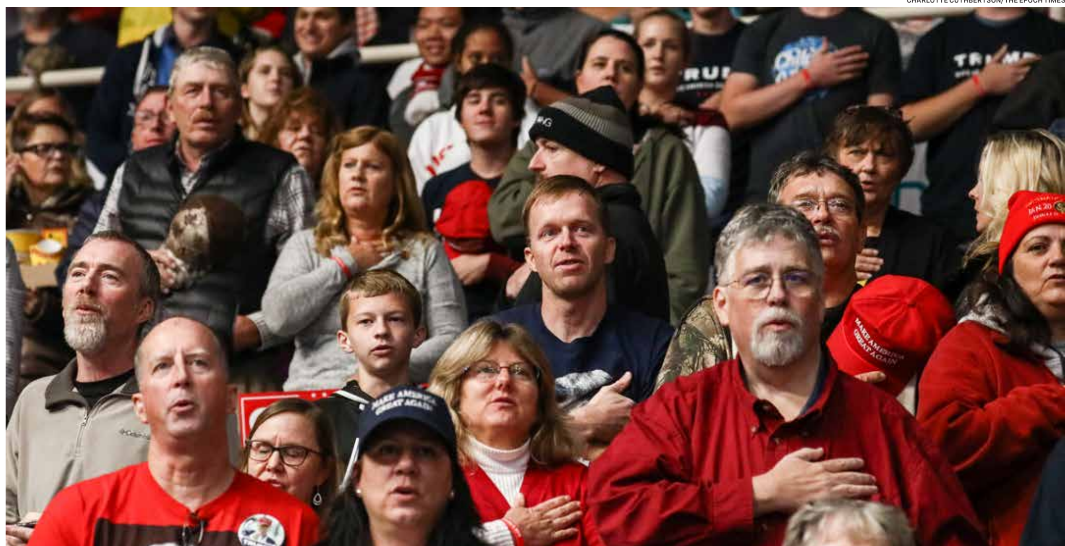
Attendees recite the Pledge of Allegiance at a Make America Great Again rally in Charlotte, N.C., on Oct. 26, 2018.