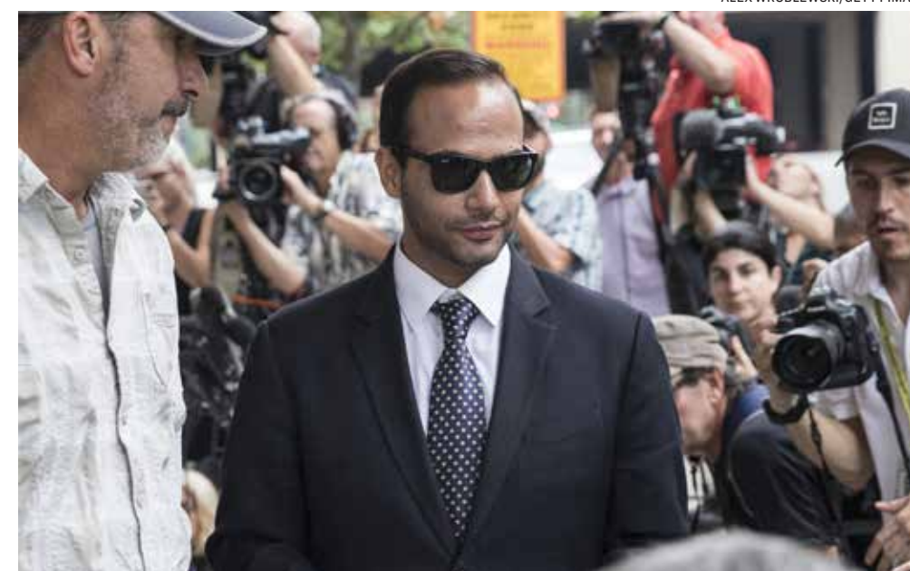
Former Trump campaign aide George Papadopoulos leaves the U.S. District Court in Washington on Sept. 7, 2018.

A request for comment from Scotti, emailed to Link Campus, went unanswered.