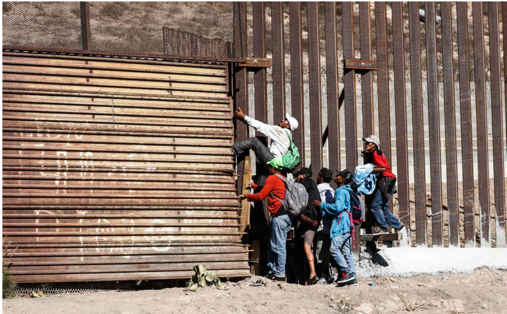
Migrants break through the U.S. border fence just beyond the east pedestrian entrance of the San Ysidro crossing in Tijuana, Mexico, on Nov. 25, 2018.