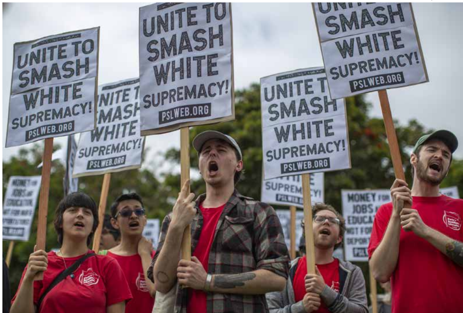
Protesters hold placards by the Party for Socialism & Liberation, in Long Beach, Calif., on April 28, 2019.