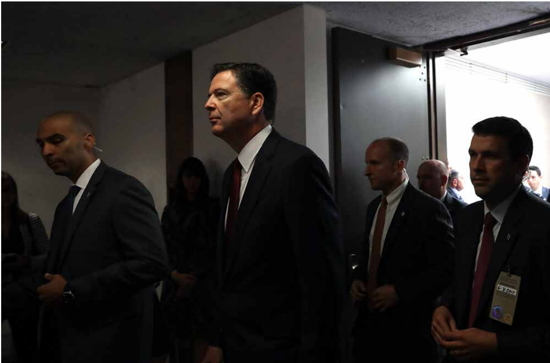
Former FBI Director James Comey (C) walks to a closed hearing before the Senate Intelligence Committee on Capitol Hill on June 8, 2017.