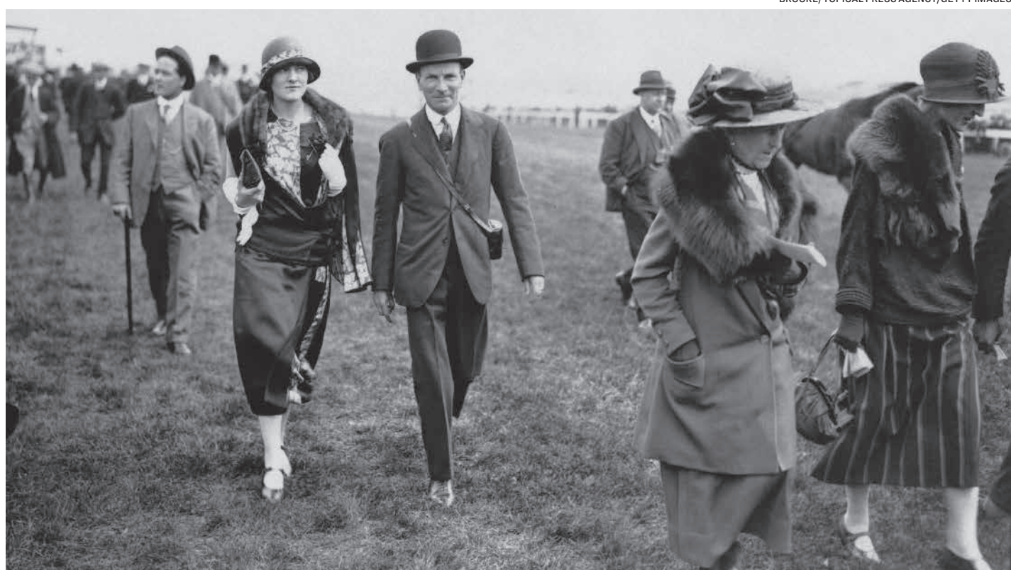
People attend the Epsom Derby in Surrey in 1924.

The left's list of nondebatable 'civil' positions is almost endless.