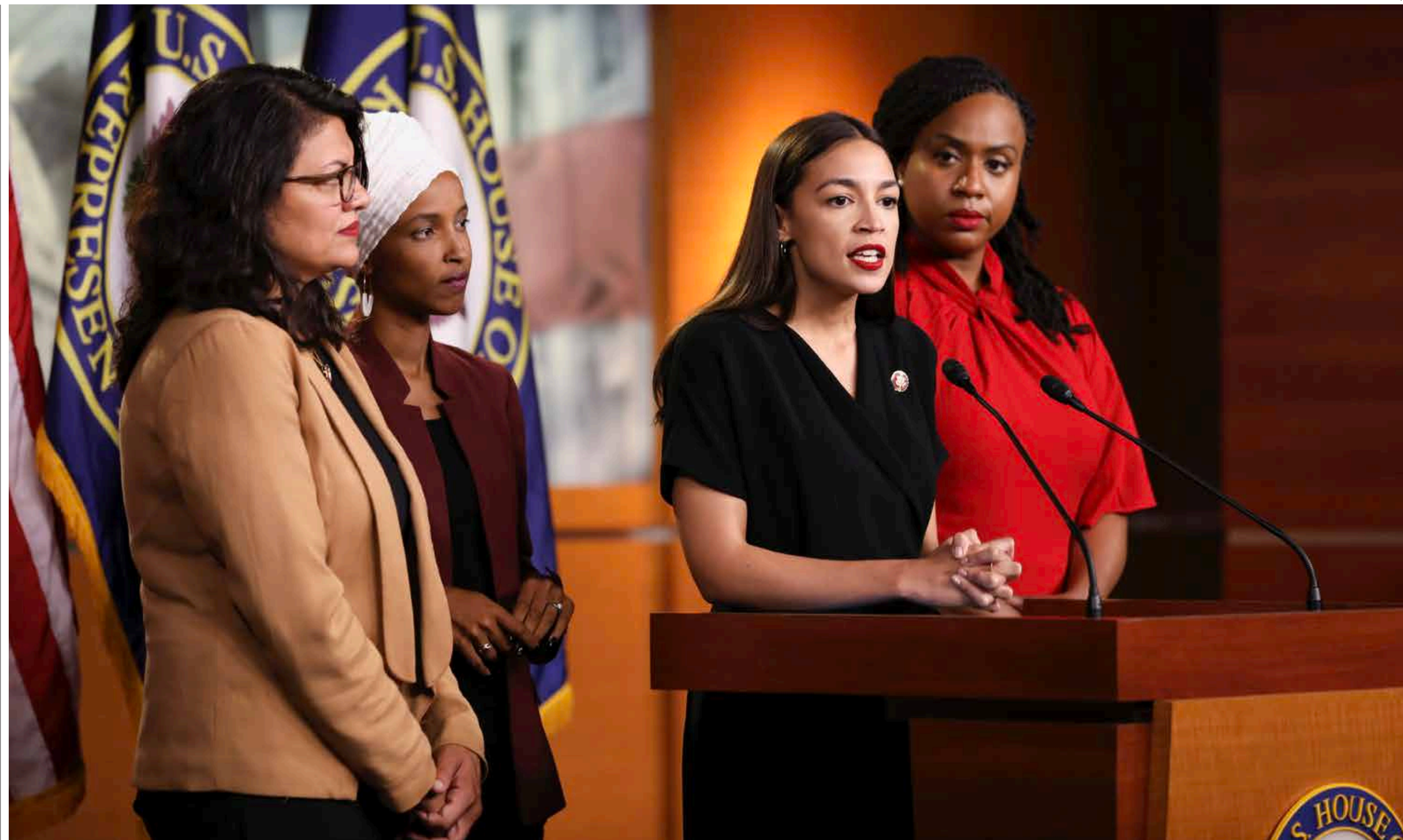
(L-R) Reps. Rashida Taib (D-Mich.), Ilhan Omar (D-Minn.), Alexandria Ocasio-Cortez (D-N.Y.), and Ayanna Pressley (D-Mass.) at a press conference at the U.S. Capitol on July 15, 2019.

Sen. Bernie Sanders (I-Vt.) arrives for a rally to kick off his 2020 presidential campaign in Brooklyn, New York, on March 2, 2019.