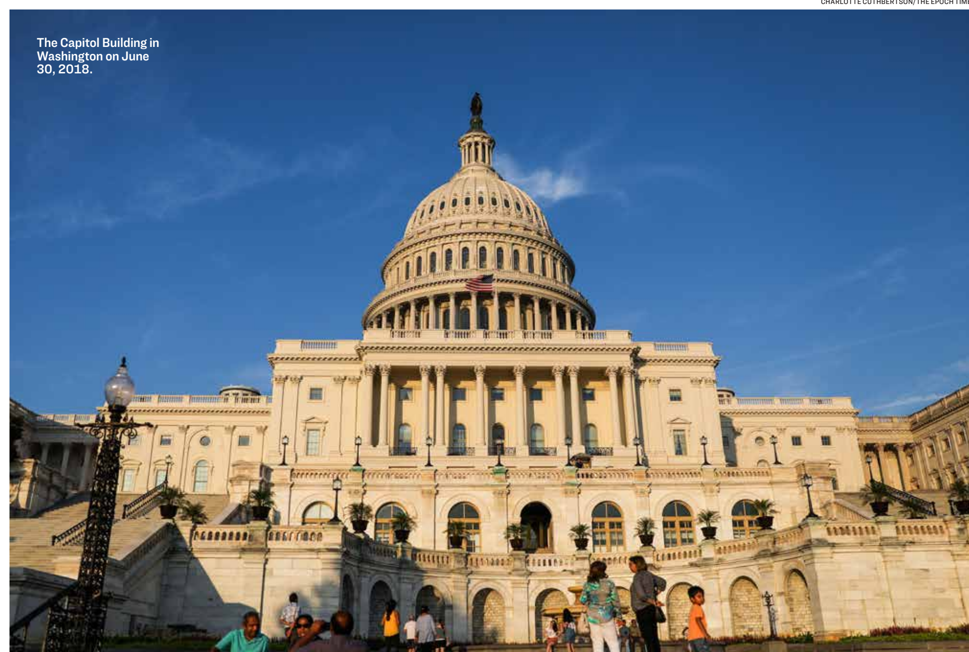
The Capitol Building in Washington on June 30, 2018.

Who determines whether someone is mentally unfit to own a firearm?