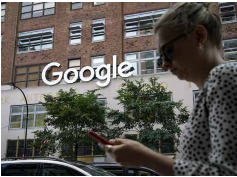
A woman looks at her smartphone as she walks past the Google New York office in New York on June 3, 2019.