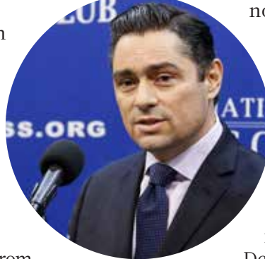
Carlos Vecchio, Venezuela's ambassador to the United States, at the National Press Club in Washington on July 30, 2019.