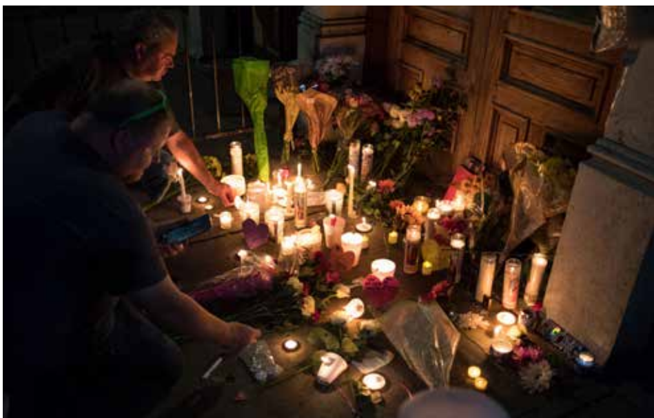
Two men light candles at a makeshift memorial during a candle vigil in honor of those who lost their lives or were wounded in a shooting in Dayton, Ohio, on Aug. 4, 2019.

But is the United States in any real danger of becoming the Soviet Union 2.0? Is paranoia that one day, someday, people might abuse red flag laws to lock up innocent people a reason to continue doing what we've been doing, which clearly isn't working? I don't think so.