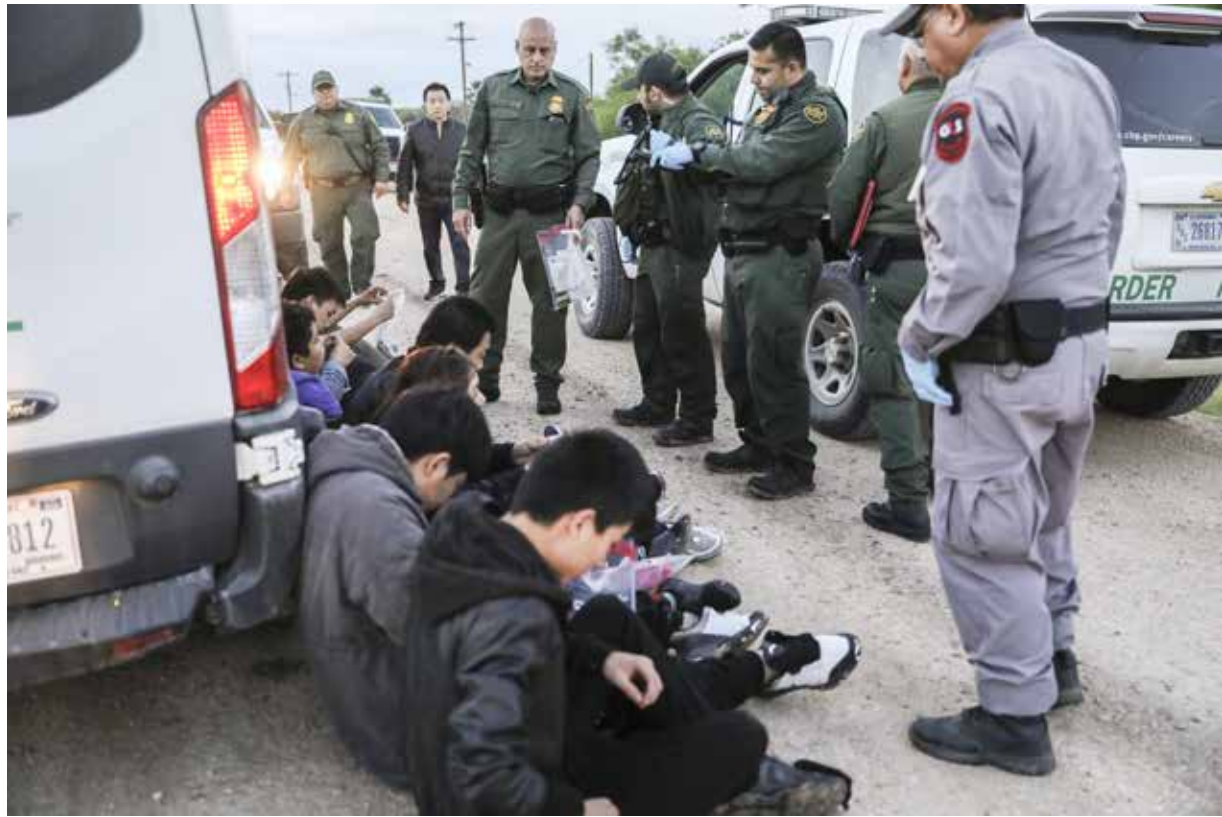
Border Patrol agents apprehend seven illegal immigrants from China, one from Mexico, and one from El Salvador after they tried to evade capture after crossing the Rio Grande from Mexico into the United States near McAllen, Texas, on April 18, 2019.

tion by would-be asylees who enter the U.S. outside a legal port of entry, but took the position such individuals were ineligible to seek asylum in the first place.