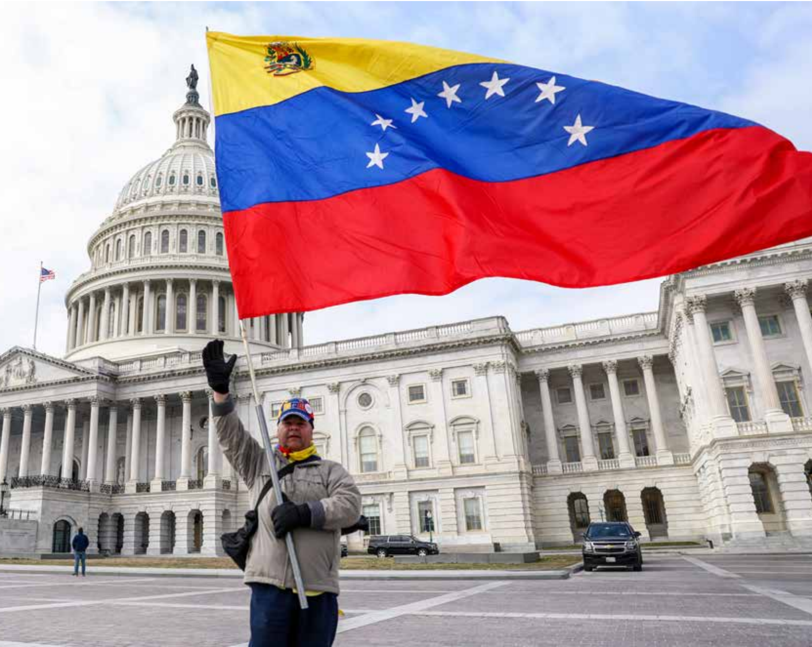
A man waves the Venezuelan flag in front of the Capitol building in Washington on March 7, 2019.

"The bureaucracies of both parties for decades have been unwill-