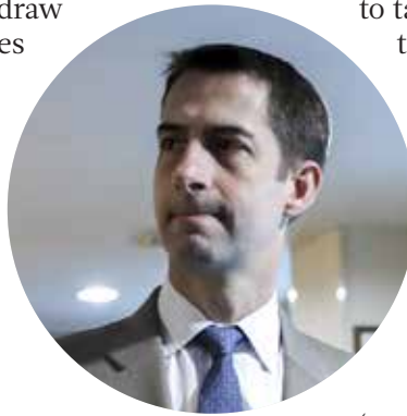
Sen. Tom Cotton (R-Ark.) in Washington on July 30, 2019.

Currently, only Liberians have such status, which was designated in 2007 by President George W. Bush. It has currently been extended to March 30, 2020.