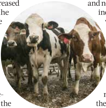
Cows on a farm-land in Wilson County, Tenn., on Jan. 10, 2018.

“But apparently those aren't enough to hold progress on certain topics entirely. So that's positive,” he said. “There appears to be robust dialogue and an ability to reach an [trade] agreement.”